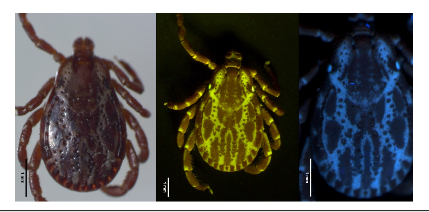
Figure 1 Micrographs showing a dorsal view of Dermacentor variabilis (male) to compare each light source. White light (left), royal blue (RB, 440-460 nm) (middle) and ultraviolet (UV, 360-380 nm) (right). Variation in ornamentation illuminated by the different light sources can also be noted.

Table 1 shows the positive and negative results for fluorescence in both sexes. The following structures showed fluorescence in all species and sexes: anal groove, genital pore, spiricals, setae, ventral idiosoma, hypostome, palpal articles, cheliceral sheath, leg segments, arthrodial membrane, and the apotele. All species with eyes and ornamentation present showed fluorescence in those structures (Figure 1). Fovae and lamellae were intentionally observed only in A. americanum females due to limited access to a fluorescent microscope, but these structures are presumed to be fluorescent in females of the other species. Portions of the basis capitulum are not fluorescent in I. scapularis contrary to the other species.