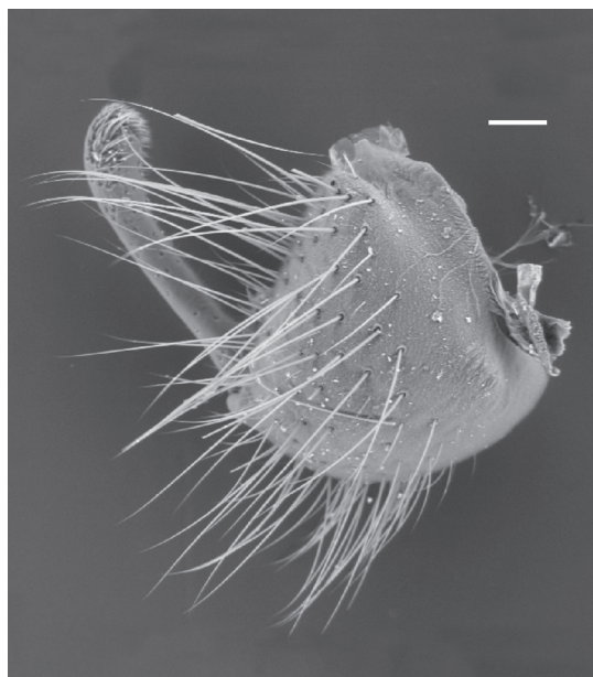
FIG. 3. — Chionea mirabilis n. sp., holotype ♂, basistyle in dorsal view (vacuum mode: variable pressure; VP Target: 4.50 e-001 Torr). Scale bar: 100 µm.