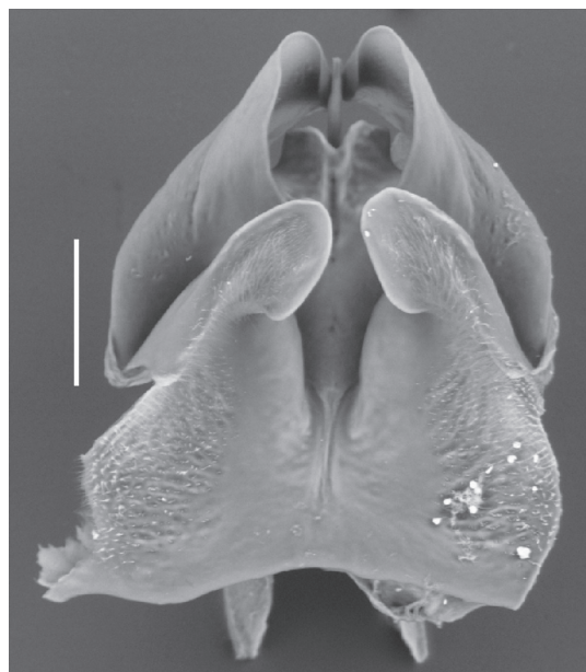
FIG. 4. — Chionea mirabilis n. sp., holotype ♂, detail of the male genital structures, gonapophysis and aedeagus (vacuum mode: variable pressure; VP Target: 4.50 e-001 Torr). Scale bar: 100 µm