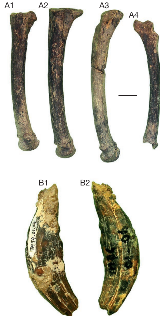
FIG. 5. — Tchadailurus adei n. gen., n. sp., TM 112-00-99, from Toros Menalla. Metatarsals: right Mt II (A1) and Mt III (A2) in medial view; left Mt IV lateral view (A3) and subcomplete left Mt V in anterior view (A4). Dinofelis sp., TM 74-01-06, from Toros Menalla: left upper canine in lateral (B1) and medial (B2) views. Scale bar: 10 mm.