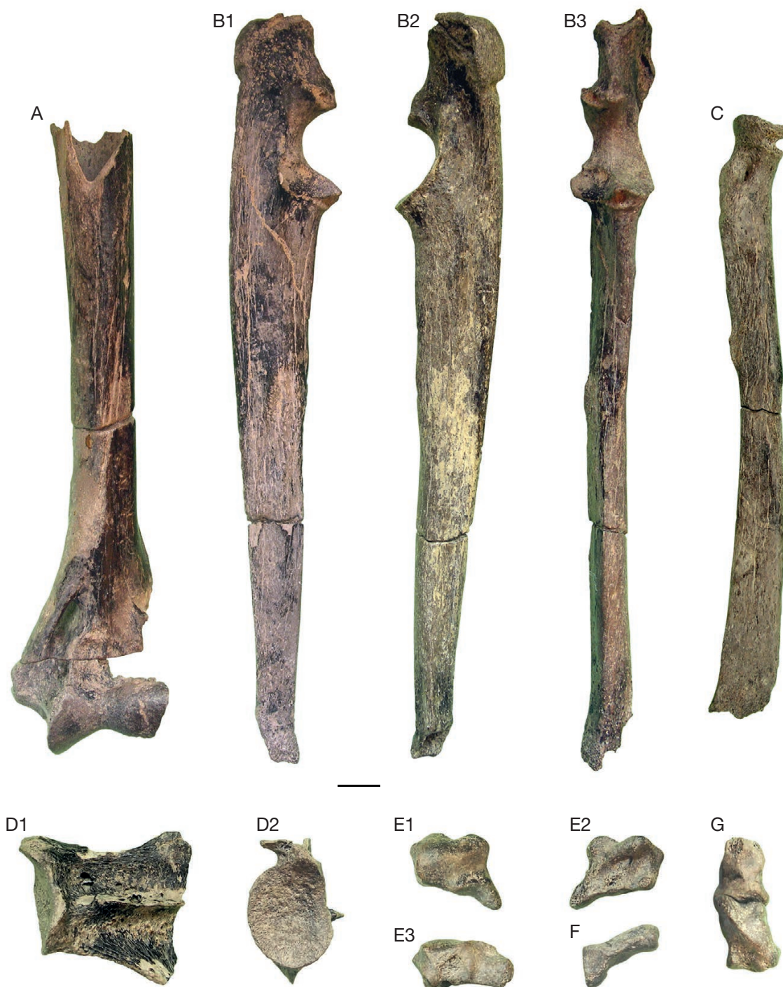
FIG. 2. — Tchadailurus adei n. gen., n. sp., TM 112-00-99, from Toros Menalla. Fragment of left humerus in anterior view (A); subcomplete right ulna in lateral (B1), medial (B2), and anterior (B3) views; subcomplete left radius in medial view (C); proximal fragment of left scapula in lateral (D1) and proximal (D2) views; left scapholunar in proximal (E1), distal (E2), and posterior (E3) views; right pisiform in lateral view (F); articulated right Mc I and first phalanx of digit I in anterior view (G). Scale bar: 10 mm.

of the body. The other cervical vertebra lacks the neural and transverse processes. It has a long long body, relatively longer than any post-axis cervical of modern felids except Leptailurus serval in which we observe that C3, and C4 to a lesser extent, have a relatively long body. A single incomplete lumbar of TM 112-00-99 is available. It is laterally compressed, most of the body and the transverse processes are not preserved. Ten