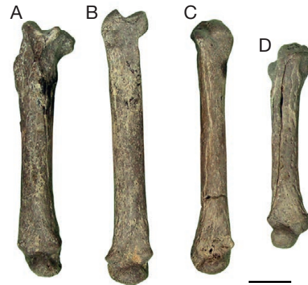
FIG. 3. — Tchadailurus adei n. gen., n. sp., TM 112-00-99, from Toros Menalla. Left metacarpals in dorsal view: Mc II (A), Mc III (B), Mc IV (C), and Mc V (D). Scale bar: 10 mm.

The radius (Fig. 2C) and ulna (Fig. 2B) are robust and have a typical felid morphology. The available fragments of the left and right ulna allow to have a nearly complete view of the anatomy of this bone in TM 112-00-99. The proximal two-thirds of the shaft are laterally compressed, but its distal third is robust, triangular in section. The right olecranon is almost complete; the anterior part of its proximal face is marked by a wide and deep fossa bordered by two tubercles; the tip of the lateral tubercle is broken off but was probably lower than the medial tubercle. The caudal face of the olecranon is wide and expands medially (area of insertion for the large head of the m. triceps brachii ). The radius has a craniocaudally