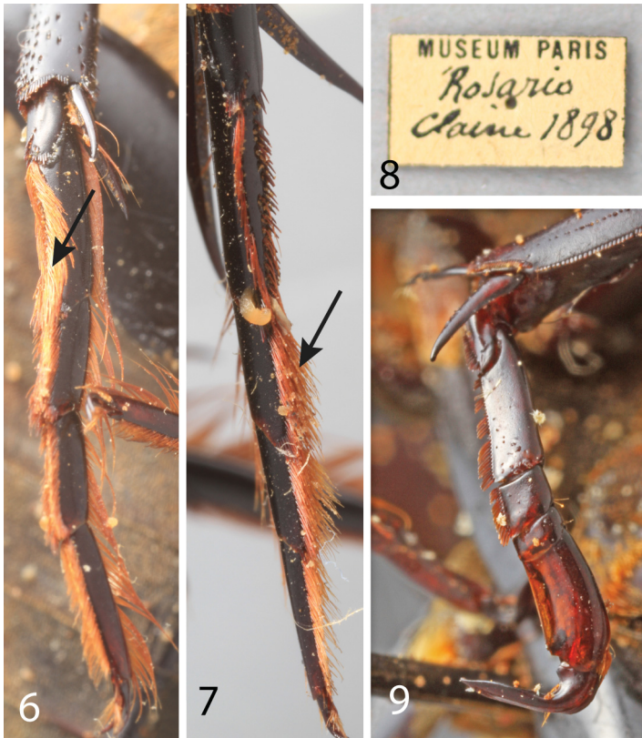
Figs 6–9. Hydrophilus (D.) masculinus (Régimbart, 1901), male lectotype: 6 – mesotarsus, 7 – metatarsus, 8 – protarsus, 9 – label. Arrows in Figs 6–7 note the dense tuft of ventrally-facing setae.

Remarks. Of the specimens of H. masculinus he examined, RÉGIMBART (1901) remarked as follows: ‘République Argentine: Rosario (Claine, 1898), collection du Muséum de Paris et la mienne’. It is clear from the description he saw both males and females though he does not indicate the number of specimens he examined. In the collection of Régimbart, which is maintained separately at MNHN, the Hydrophilus specimens are arranged as he had them in the same order as presented in the 1901 publication. There are four specimens situated