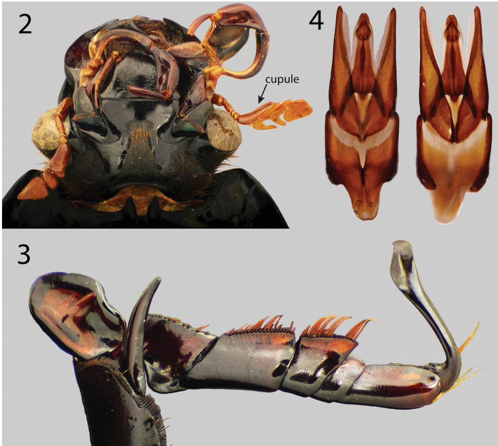
Figs 2–4. Hydrophilus (D.) harpe sp. nov. 2 – male paratype, head, ventral view; 3 – male paratype, protarsus; 4 – male holotype, aedeagus, dorsal and ventral views.

shield-like, the other slightly curved and pointed at apex (Fig. 3). Single row of long setae on inner margin of protibiae. Male protasal claws asymmetrical, with outer claw extremely long and recurved, the apex explanate and forming a sickle-shaped hook (Fig. 3) and with inner claw shorter and not expanded or flattened apically. In males, ventral face of meso- and metatarsi set with rows of thick, dense setae appearing as a brush; in females, they are set with only 2–3 regular rows. Abdomen with five exposed ventrites; ventrites 2–5 subequal in length. Ventrites densely covered with uniform short pubescence; ventrites 3–5 with a medial glabrous patch of varying size: glabrous patches on ventrites 4 and 5 subequal in length, glabrous patch on ventrite 3 ca. one-third length of other patches. Glabrous patches on ventrites 3 and 4 subequal in width, ca. one-fourth width of patch on ventrite 5. Posterior margin of ventrites 3 and 4 slightly overhangs onto following segment; overhang of fourth segment margin far more pronounced. Glabrous patch on ventrite 5 creased medially due to elevated ridge down abdominal midline. Aedeagus as in Fig. 4.