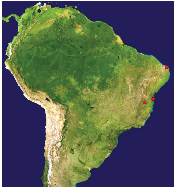
Fig. 5. Hydrophilus ( D. ) harpe sp. nov., distribution map.

Distribution. Known from two localities situated in Northeastern Brazil (Ceará-Mirim Municipality in Rio Grande do Norte State and Itabuna Municipality in Bahia State) and from Southeastern Brazil (Águas Vermelhas Municipality in northernmost Minas Gerais State, near border with Bahia State) (Fig. 5).