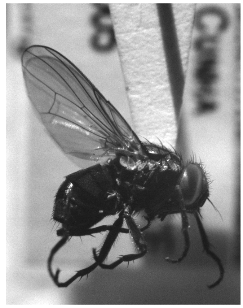
Fig. 3: A Lesser Housefly, Fannia albitarsis STEIN, 1911. A lateral view of the female specimen collected from the potato patches on Tristan da Cunha in 2005.

As with C. trina and the other three species, the occurrence for the first time of Fannia albitarsis STEIN on the archipelago can be attributed to an introduction by unnatural means. This could have been from South Africa, but its exact distribution there is not known and, on the face of it, the most probable point of origin seems to have been its original home in the south of South America, perhaps via the sealers.