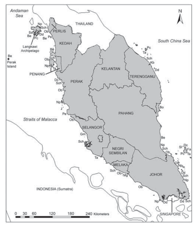
Fig. 2. Map showing the locations of live sightings and strandings of various cetacean species in Peninsular Malaysia as listed in the updated checklist in Table 3. Each species' code on the map is according to the two-letter abbreviations listed in Table 3.

Checklist of marine mammals. — A total of 27 species of marine mammals from 21 genera and seven families have been recorded in Malaysia. These comprise species that are known solely from stranding records, live sightings, or both. New species records for Peninsular Malaysia since the last published checklist (i.e. Jaaman, 2004) are the Omura's whale (Balaenoptera omurai), pygmy sperm whale (Kogia breviceps), pantropical spotted dolphin (Stenella attenuata), striped dolphin (S. coeruleoalba), and the pygmy killer whale (Feresa attenuata) (Table 3). The Omura's whale record was based on half a carcass that washed ashore in Pahang in 2008, and was identified as an Omura's whale based on the morphology of its skull (Wada et al., 2003; T. Yamada, pers. comm.). The pygmy sperm whale record was based on newspaper reports with clearly identifiable photos of an adult female whale stranded in Terengganu in 2009. The pantropical spotted dolphin record was based on a stranding on Langkawi Island in 2007, while the record of the striped dolphin was based on a stranding in Kedah in 2010. The last two incidents were communicated to the author, with photographs provided by third parties. The pygmy killer whale identification is based on a skull that was found at a beach bar in Tioman Island, and which, according to locals, was from a stranded juvenile individual several years ago.