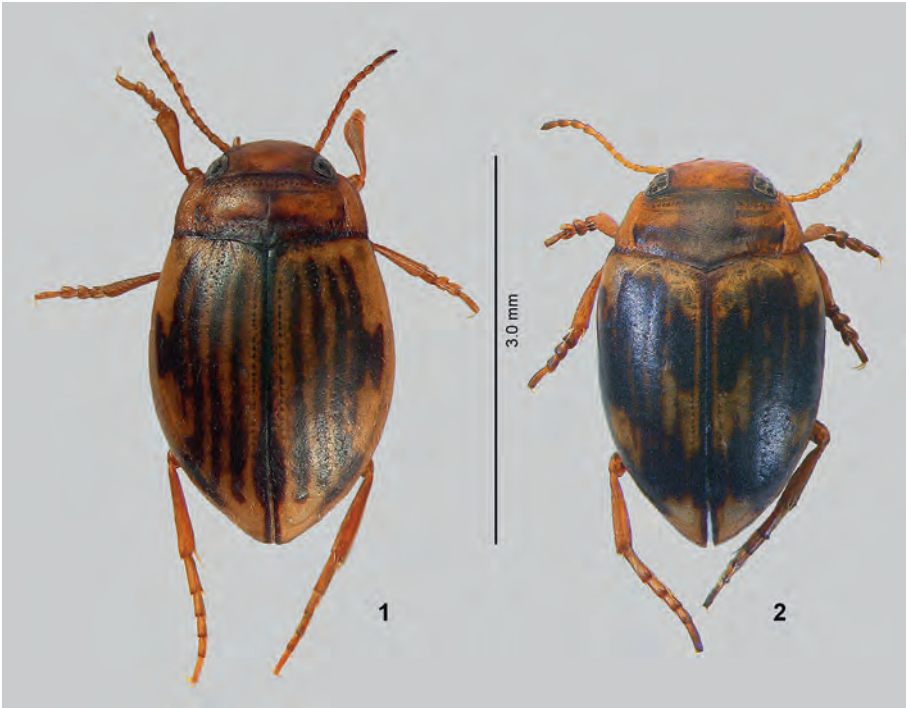
Figs 1-2. Habitus of (1) Oreodytes okulovi LAFER, 1988 and (2) O. sanmarkii sanmarkii (C.R. SAHLBERG, 1826) (both specimens from Lazovsky Nature Reserve, Russian Far East).