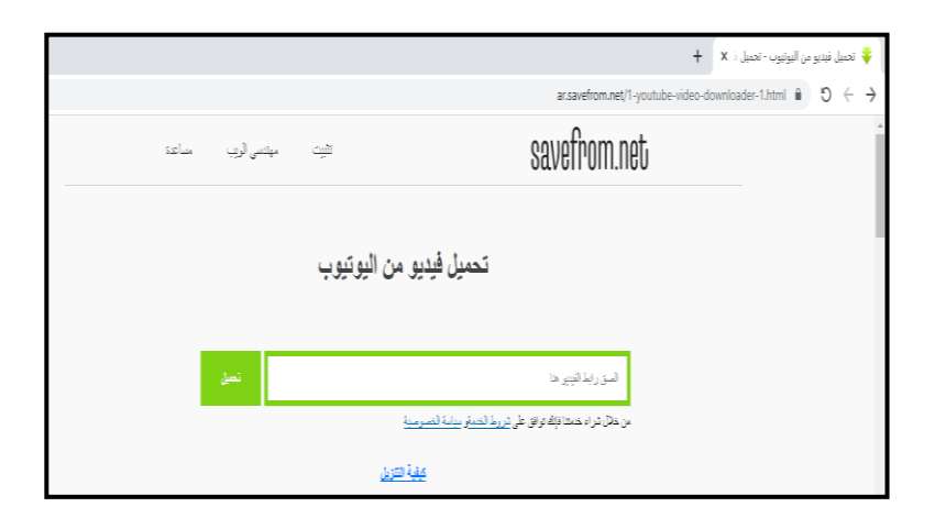
Figure (3): Software Interface (launch screen) (save from.net)

Access to (savefrom.net) in order to download the 3D video clips from Youtube.