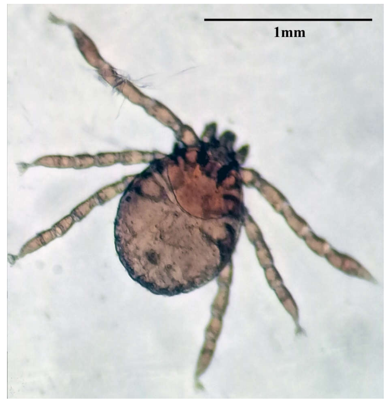
Figure 1. Dorsal aspect of a tick larvae sample collected in this study.

technique of this study is recommended to identify immature and dead tick samples that cannot be reared until the adult stage. BLASTn and comparison of evolutionary relationships between taxa are the next analysis steps on sequences (Faghihi et al. 2020). The construction of a phylogenetic tree is done using genetic distance difference; nucleotide substitution models and comparison with outgroup. The present study was the first report on the identification of H. sulcata larvae isolated from Berlese funnel. The result of this study will help to better understand the biology of this tick and the presence of immature larval stages with questing behaviour on the soil environment.