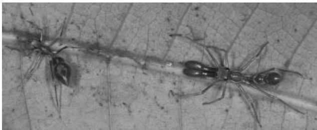
Figure 8. Myrmarachne assimilis male (on right) watching and following decamping M. assimilis female.

Females often ran to one side of the male, with the male usually succeeding in obstructing her forward progress. With or without first displaying at the male (semi-erect or erect legs I in Position 2 when more than 20 mm in front of male and Position 3 when closer than 20 mm), the obstructed female turned 90\text{--}180^\circ and decamped or, more often, backed away and then tried again to run past the male. However, the female sometimes eventually