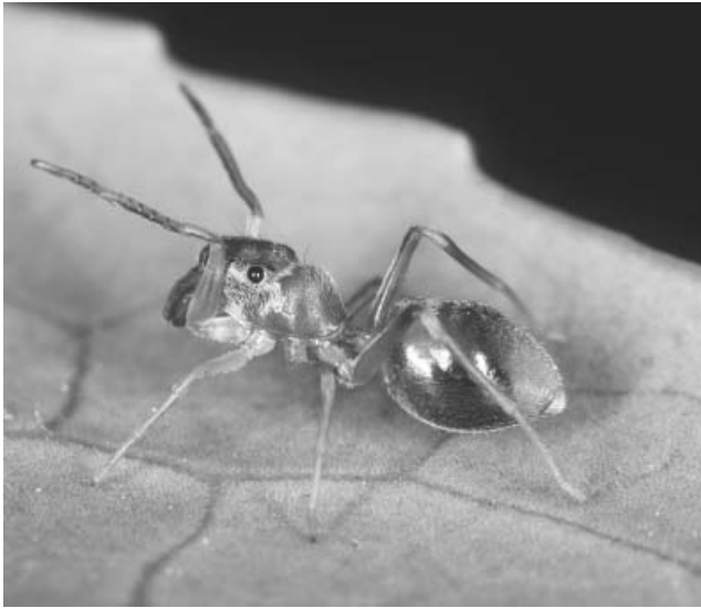
Figure 9. Myrmarachne bakeri female (facing to left) posturing (erect legs in Position 2).

became quiescent in front of a male and the male approached. When he was within touching distance, he brought erect legs I into Position 1 over the female's legs I or cephalothorax (Figures 3, 6), after which she sometimes decamped (sometimes after first lunging), and sometimes remained quiescent while copulation (Figure 7) ensued. The duration of courtship was usually about 2 min.