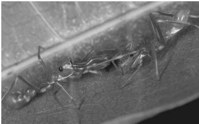
Figure 3. Myrmarachne assimilis female (on right) with cephalothorax lowered. Male beginning to mount the female.

Arch-up body: pedicel elevated higher than normal above the substrate (i.e. middle of spider's body raised), with chelicerae and posterior abdomen (spinnerets) touching or close to touching substrate (Figure 4).