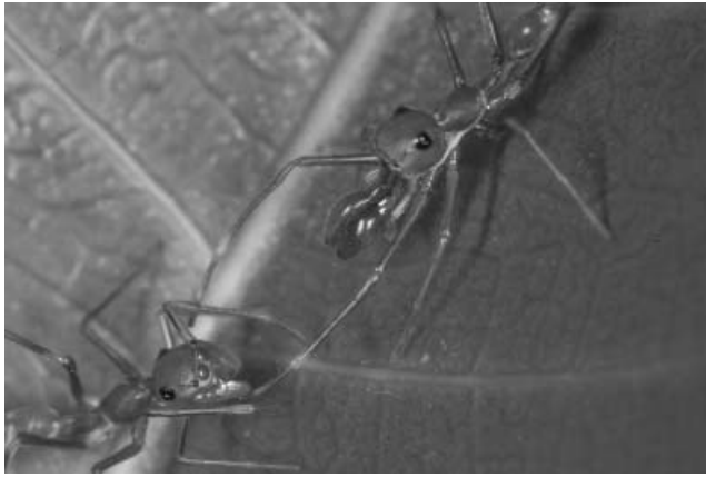
Figure 6. Myrmarachne assimilis male (upper right) beginning to premount tap female. Male's legs I semi-erect in Position 1. Female: palps spread apart.

Embrace: two spiders stand face to face with chelicerae touching, usually with palps erect and with legs I erect in Position 3 or 4 and sometimes with some combination of palps, legs I and legs II also touching.