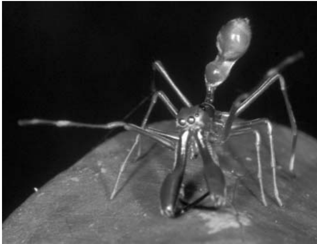
Figure 2. Myrmarachne assimilis male (facing forward and down in photograph) with his abdomen flexed up and to the side while posturing with erect legs in Position 2.

Abdomen flutter: similar to abdomen twitching, but faster, at lower amplitude and of shorter duration (ca 10\text{ s}^{-1} , <1\text{ mm} , bouts usually 1–2 s), with no superimposed side-to-side wobble noticeable (smooth in appearance).