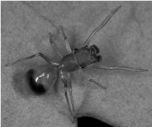
Figure 1. Myrmarachne bakeri female (facing right and slightly up in photograph) in a normal body posture and with palps and chelicerae also held in a normal posture. Erect legs in Position 3.

Abdomen twitch: moves up and down from pedicel ( 2\text{--}4\text{ s}^{-1} , 1–3 mm, bouts usually ca 3 s, appears jerky), often with slight side-to-side wobbling superimposed on the up-and-down motion.