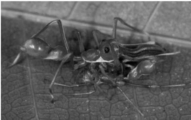
Figure 7. Male and female of Myrmarachne assimilis copulating. Male standing beside female (facing to right) while applying palp. Female: cephalothorax lowered; abdomen flexed and rotated.

Stand at side of female: after mounting, male stands with his body to left or right of female's body, legs I, II, and III over her body, but tarsi in contact with substrate on female's other side (usually not touching her) with his closer palp flush with anterior end of female's abdomen (Figure 7).