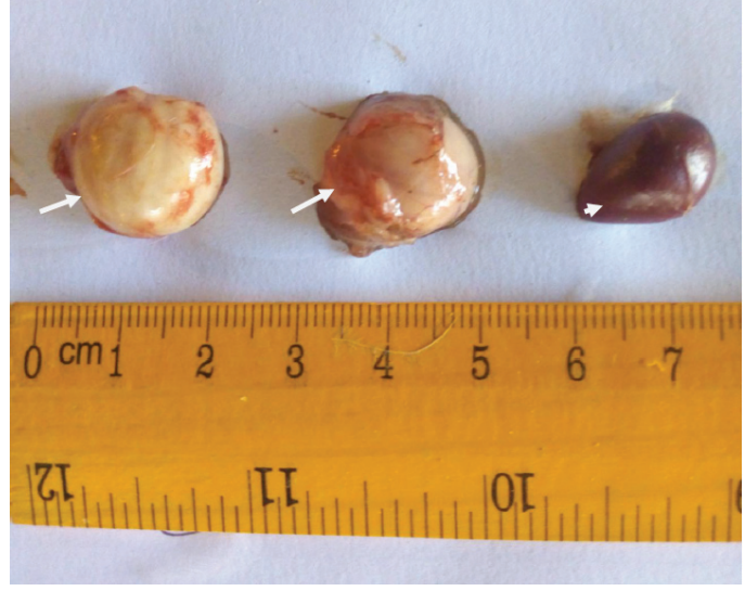
Plate V: Enlarged bursa of Fabricius and spleen in pullets (group B); (white arrows showed enlarged bursae; white arrow head showed enlarged spleen).