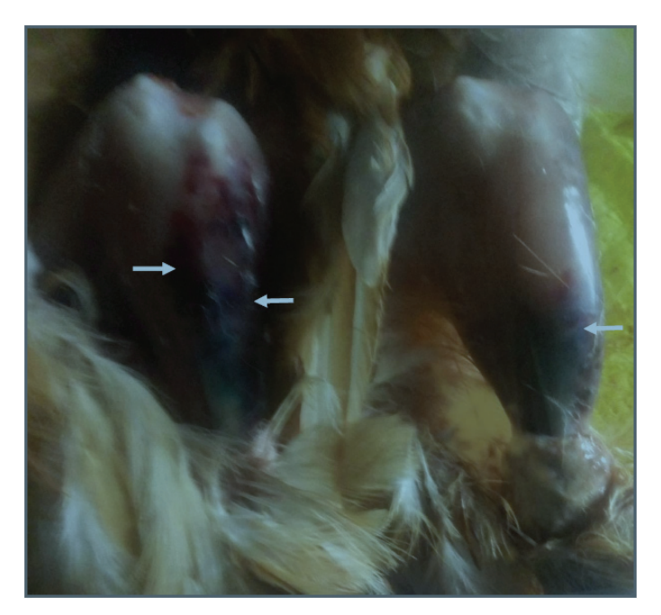
Plate 1: Ecchymotic haemorrhages of the legs muscles in pullets (group B); (white arrows showed ecchymotic haemorhage).

It was therefore recommended that BVC can be used in pullets to reduce the duration of clinical signs caused by virulent IBDV; BVC or VRX can be used to ameliorate the morbidity rate of IBDV in pullets, and VHK can be used to ameliorate the mortality rate and gross lesions caused by IBDV. SHK or BVC can be used to improve the live body weight gain of pullets infected with virulent IBDV. VRX or BVC can be used to ameliorate the decline in feed intake and reduction of packed cell volume of pullets infected with virulent IBDV. VHK can be used as immune modulator in pullets to stimulate high antibody titre against virulent IBDV.