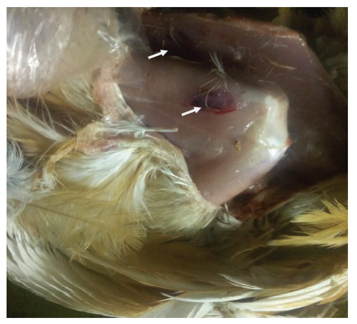
Plate IV: Ecchymotic haemorrhages of the thigh and breast muscles in pullets (group E); (white arrows showed ecchymotic haemorrhage)