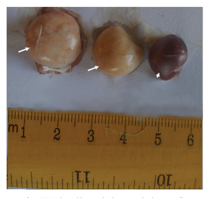
Plate VII: Enlarged bursa of Fabricius and spleen in pullets (group D); (white arrows showed enlarged bursae; white arrow head showed enlarged spleen).