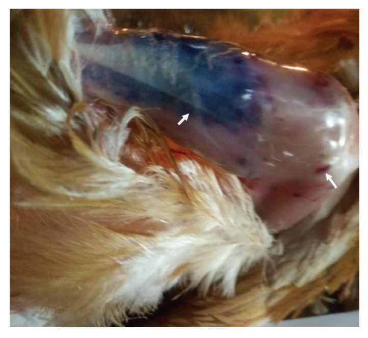
Plate II: Ecchymotic haemorrhages of thigh and leg muscles in pullets (group C); (white arrow showed ecchymotic haemorrhage).