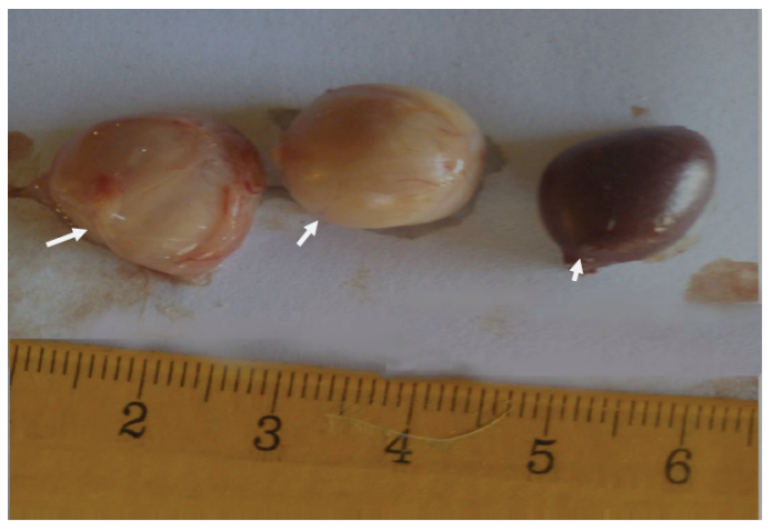
Plate VIII: Enlarged bursa of Fabricius and spleen in pullets (group E); (white arrows showed enlarged bursae; white arrow head showed enlarged spleen)