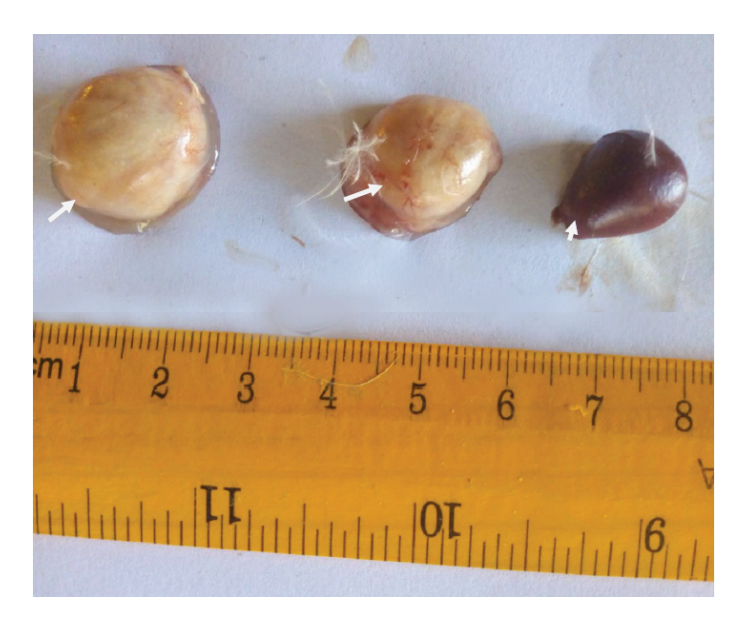
Plate VI: Enlarged bursa of Fabricius and spleen in pullets (group C); (white arrows showed enlarged bursae; white arrow head showed enlarged spleen).