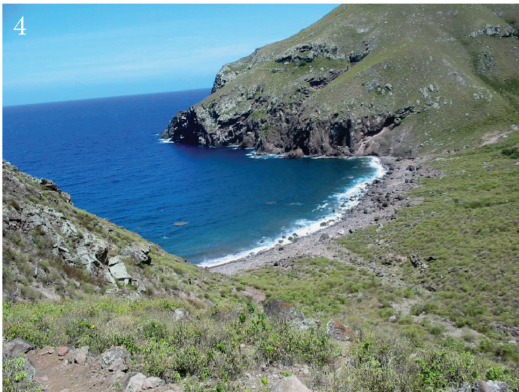
Figures 3–4. Dynastinae habitats on Saba. 3) The middle slopes of Great Hill near The Bottom, Saba, with typical vegetation of the island's mesophilic zone. The dynastine Phileurus valgus antillarum was bred from larvae collected at this locality. 4) Spring Bay, Saba, showing the dry grassland and steep slopes that are typical of the xerophilic zone of the island at its southern and western edges. No dynastines were collected in this zone.