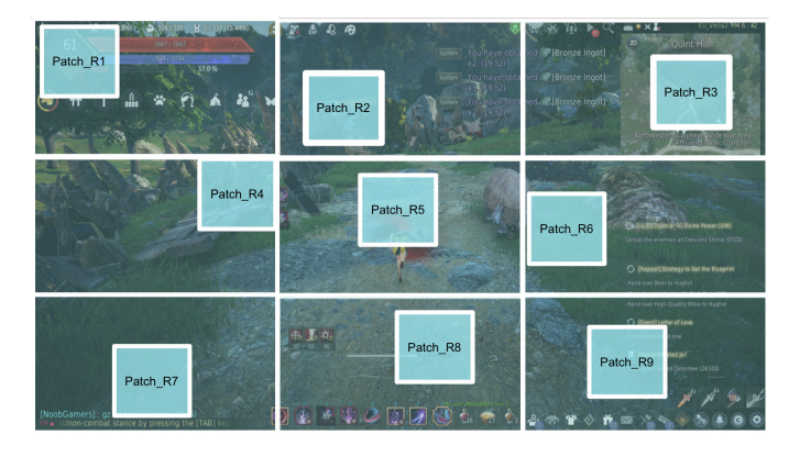
Fig. 2: The selection of patches from one sample frame.

ity enhancement model can be built with high performance accuracy.