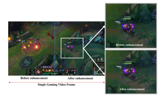
Fig. 4: Before and after enhancement illustration using a single gaming video frame. The left half frame shows the video frame before enhancement while the second right half shows the frame quality after enhancement. Zoomed-in before and after enhancement patches of the image is shown on the right side.