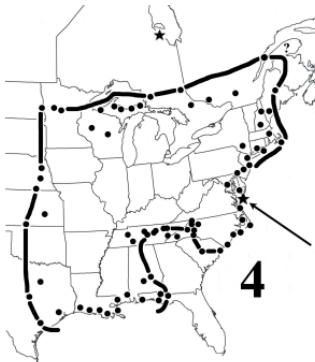
Figure 4. Distribution of Pseudopolydesmus serratus showing peripheral localities. Upper star, type locality of Polydesmus canadensis Newport, 1844, type-species of Pseudopolydesmus ; Lower Star, denoted by the arrow, approximate type locality of Polydesmus serratus Say, 1821, on the Eastern Shore of Virginia.