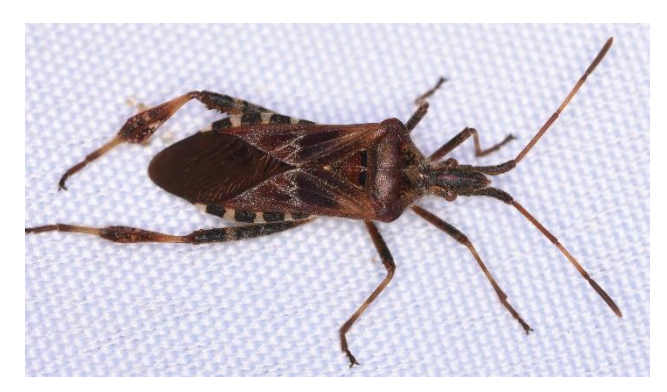
Fig. 1 . Specimen of Leptoglossus occidentalis Heidemann, 1910 found between Sīkrags and Mazirbe villages – photo by Mareks Ieviņš.

The three specimens observed on 23.01.2021 and 24.01.2021 were found at air temperatures of 2–4° C, seemingly 'frozen'/still and not moving (Mareks Ieviņš and Valda Ērmane, personal communication).