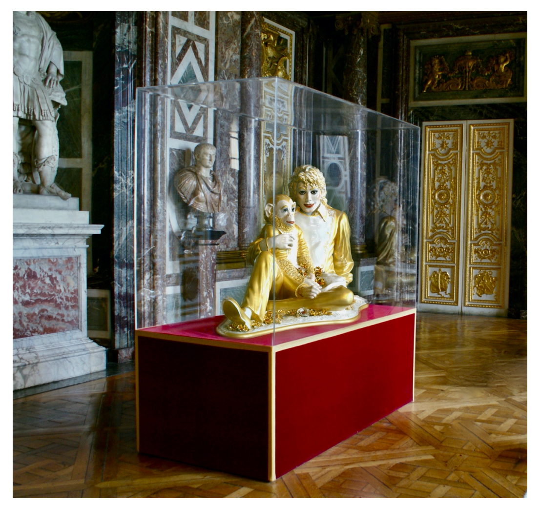
Figure 2. Jeff Koons, Michael Jackson and Bubbles , Banality series, 1988. Photo by Marc Wathieu. Chateau de Versailles. November 21, 2008. Licensed under CC BY-NC-ND 2.0.