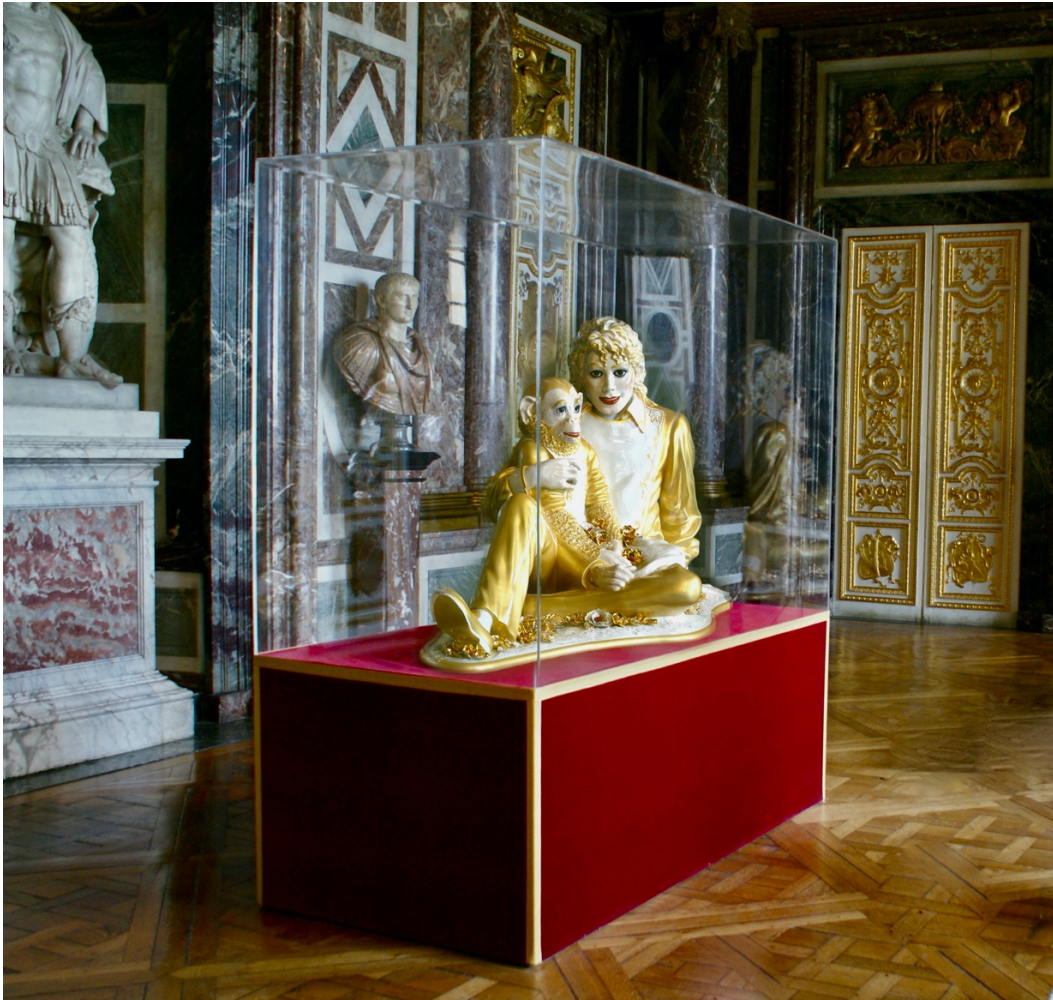
Figure 2. Jeff Koons, Michael Jackson and Bubbles , Banality series, 1988.

Photo by Marc Wathieu . Chateau de Versailles. November 21, 2008.