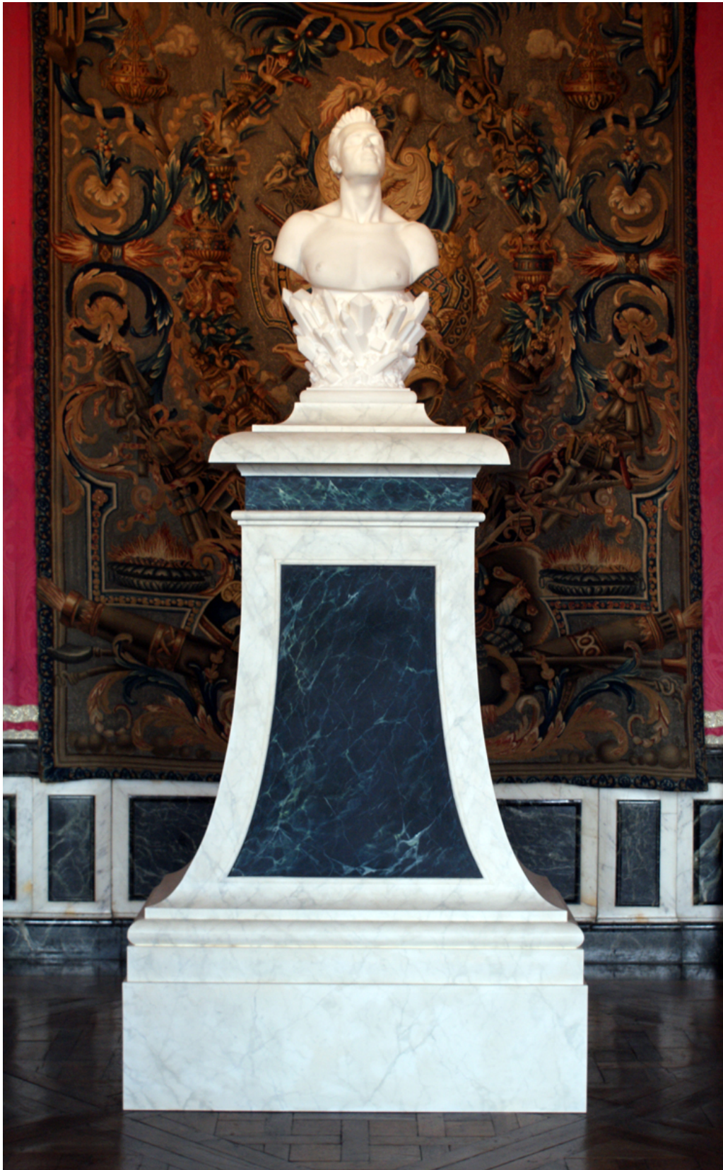
Figure 5. Jeff Koons, Self-Portrait, Made in Heaven series, 1991. Photo by Marc Wathieu . Chateau de Versailles. November 21, 2008. Licensed under CC BY-NC-ND 2.0.