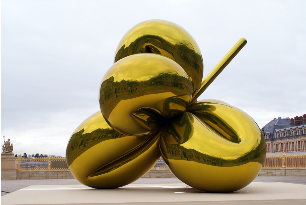
Figure 1. Jeff Koons, Balloon Flower, Celebration series (1995-1999). Chateau de Versailles. November 21, 2008. Licensed under CC BY-NC-ND 2.0.