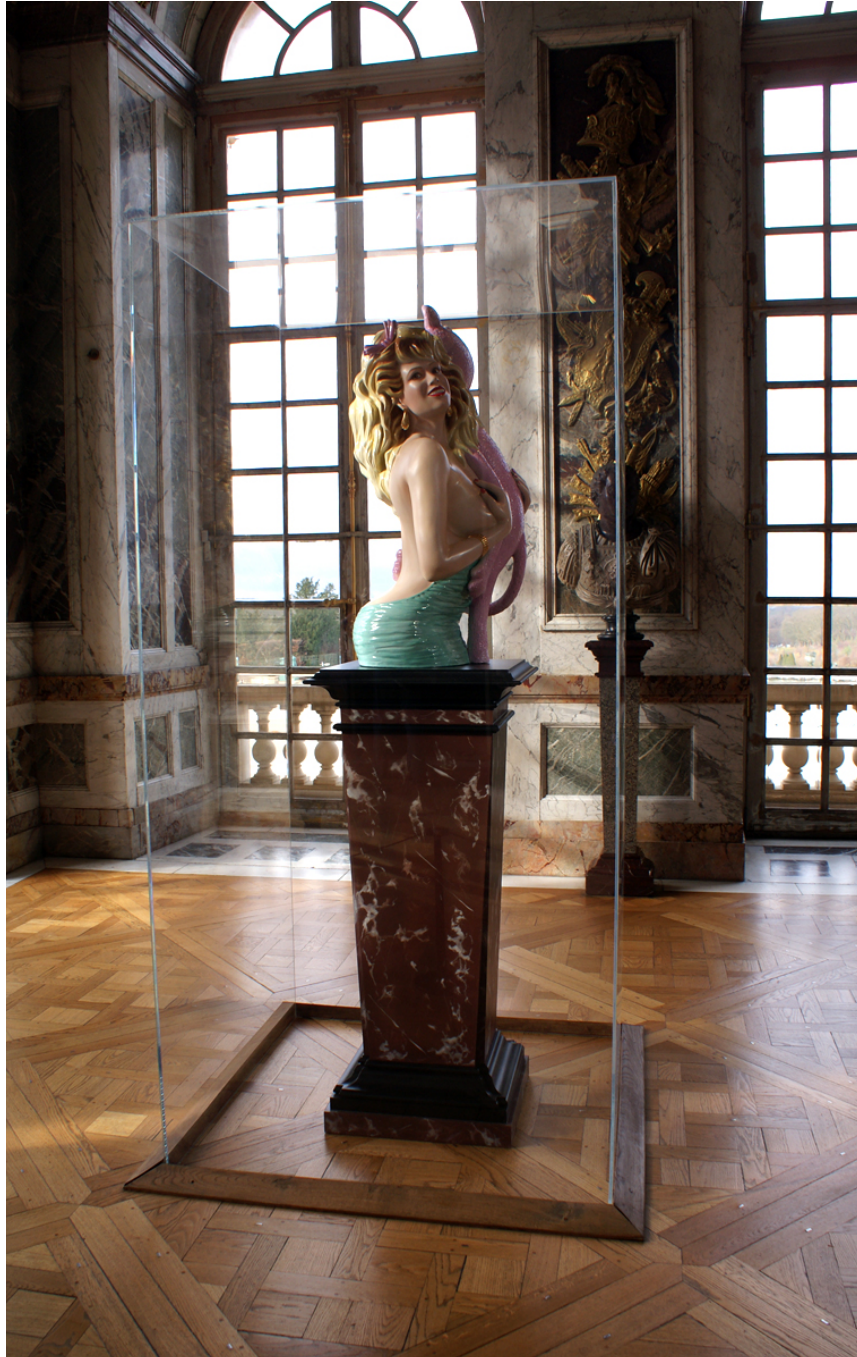
Figure 3. Jeff Koons, Pink Panther , Banality series, 1988. Photo by Marc Wathieu . Chateau de Versailles. November 21, 2008. Licensed under CC BY-NC-ND 2.0.