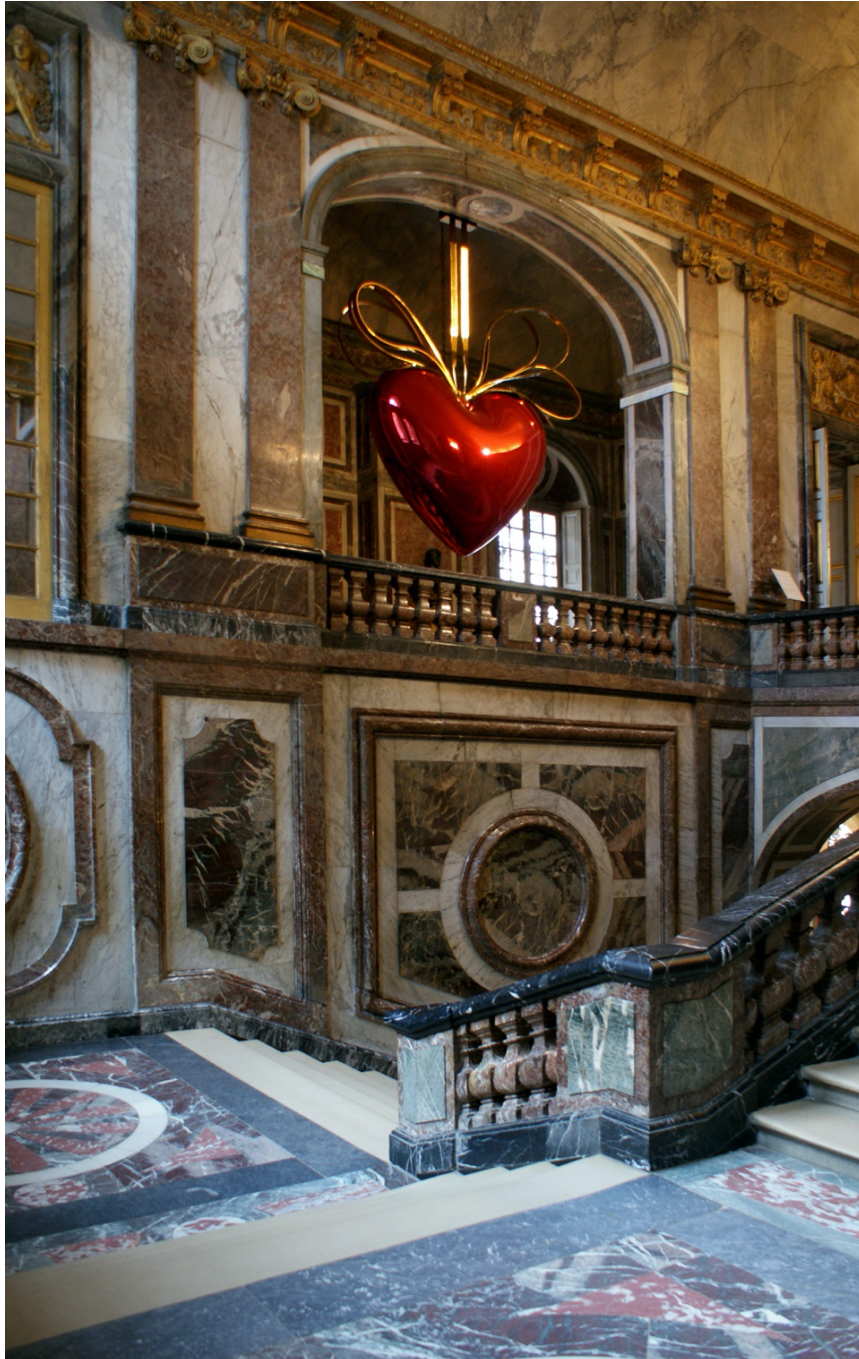
Figure 4. Jeff Koons, Hanging Heart (Red/Gold), Celebration series (1994-2006). Chateau de Versailles. November 21, 2008. Licensed under CC BY-NC-ND 2.0.