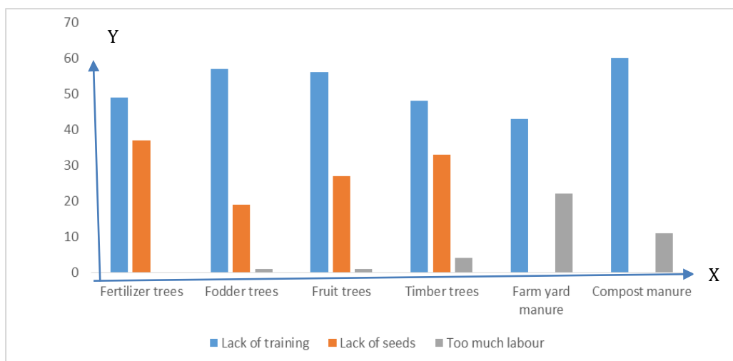
Figure 2 Constraints to the adoption of agroforestry practices

shredding of material, layering, mixing and watering. Most farmers consider the activities to be labourous and would not want to do it.