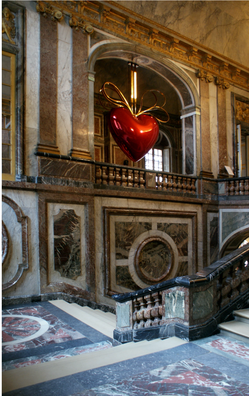
Figure 4. Jeff Koons, Hanging Heart (Red/Gold), Celebration series (1994-2006). Chateau de Versailles. November 21, 2008. Licensed under CC BY-NC-ND 2.0.