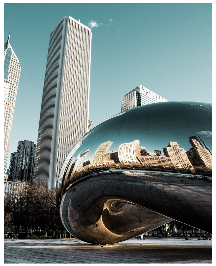
Figure 3. Anish Kapoor, Cloud Gate. Chicago, Illinois.

Finally, this conception of the history of art as jurisprudence almost demands the constitution of a place of transmission different from the galleries and museums of contemporary art, in which future works can arise in an appeal to a climate and environment without needing precautions to be institutionalized. It is difficult to find non-institutionalized artwork in the universe of contemporary art. As well as not being part of the system of art in general, considering evident, all exchange of values relations. This also applies to public works, which is precisely why these have corporate sponsorships and government tax support or incentives. For example, Cloud Gate is a public sculpture by artist Anish Kapoor, hosted by AT&T Plaza at Millennium Park, Chicago, Illinois as figure 3 shows.