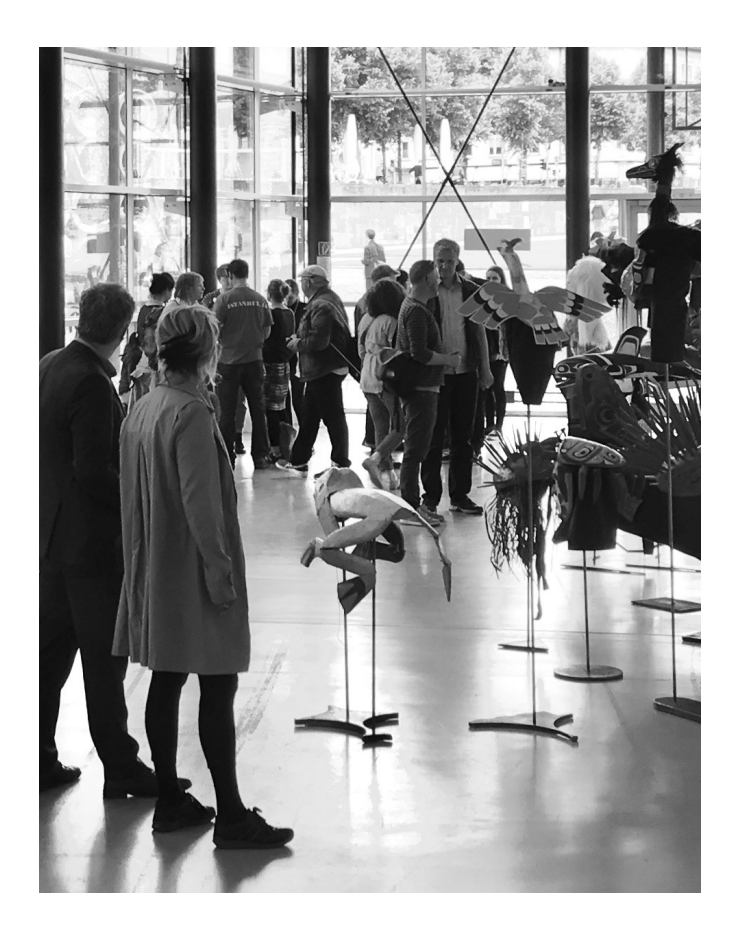
Figure 1. An installation view of Beau Dick's The Undersea Kingdom at documenta Halle. Curator: Candice Hopkins. Photo: Christiane Wagner, documenta 14, Kassel, Germany, 2017.

Therefore, this individual or artist—in his/her current socio-historical context, wherein meaning exists in globalization, democracy, and, above all, consumer society—is conditional in all these experiences becoming the aspiration of an idealized democracy. Such process is analyzed when the authenticity criterion of art transforms the artistic production relations and social functions into art, in respect of cultural value as political and social progress seeking the "democratization of art", and to discuss the democracy and the sociopolitical context regarding inequality, post-colonialism, exploitation of minorities, immigration, race, gender, and climate change. For example, in documenta 14, curator Candice Hopkins stated: "a set of masks from the series, The Undersea Kingdom , co-produced by Canada Council for the Arts, was specifically made for 'documenta 14,' by Beau Dick, who was a hereditary chief, an activist, and a cultural leader, was an active means for the First Nations communities to resist the more than 500 years of colonization," as figures 1 and 2 show.