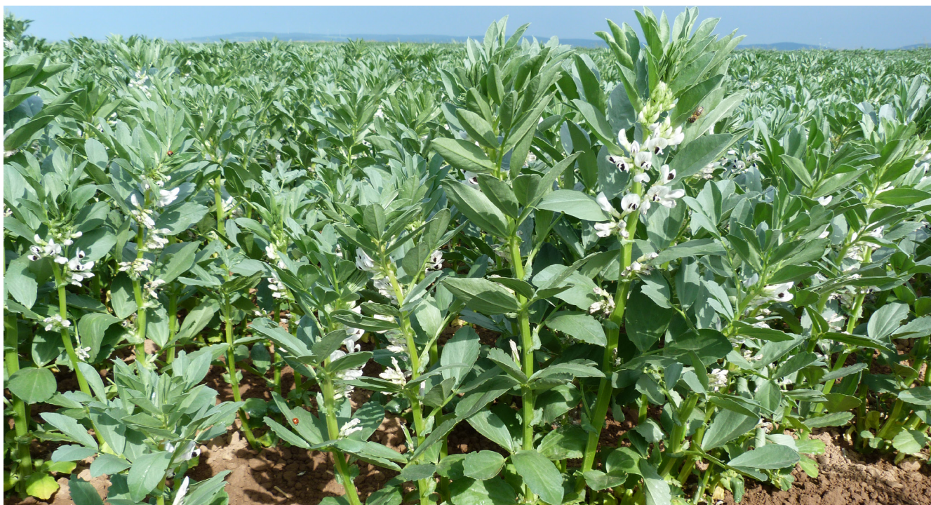
Faba bean in the field.

Grain legumes are used in livestock feed primarily for their protein content. Faba bean with 12% moisture is about 26% protein.