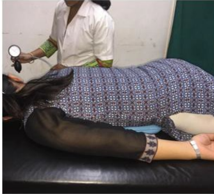
Fig.1:- Examiner scoring the Inter-Rater Reliability.