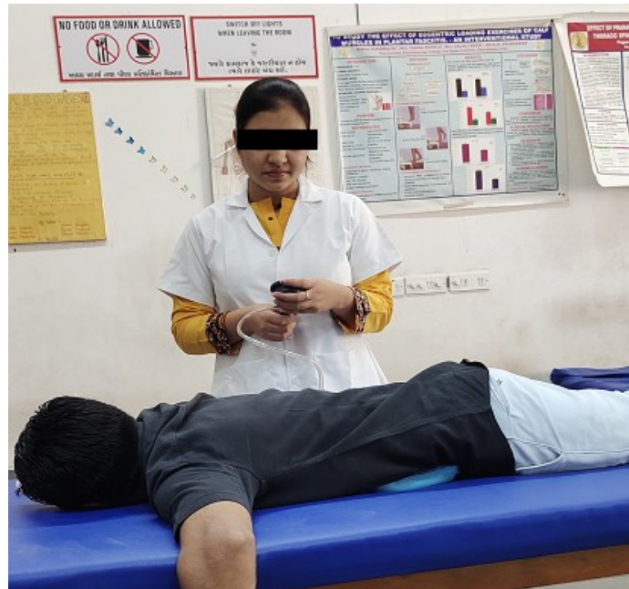
Fig. 2:- Examiner scoring the Intra-Rater Reliability.

For inter-rater reliability, both examiners did the test one after the other on the same day. For intra-rater reliability, the Examiner A carried out the test twice at the interval of 2 days. Following a period of instruction in the abdominal drawing-in test each subject was assessed in a randomized order during first visit by both the examiners. Both examiners and subjects were blind to the result of previous attempts.