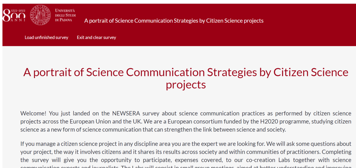
Figure 2: Page of UNIPD to directly access to the survey. Available at: https://websurvey.unipd.it/survey/index.php/816644?lang=en

The entire corresponding text is here transcribed, highlighting in bold the way to manifest the informed consent to participate in the survey .