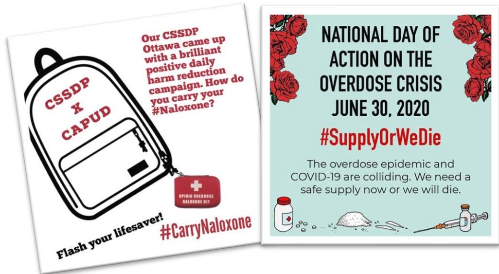
Figure 3: Examples of graphics from CAPUD's Facebook page

If you are creating graphic art definitely look into creating an Instagram account to spread your message to the world. For graphic examples check out CAPUD's Facebook page, it has dozens of examples. Designs can be as simple as white text on a black background. Software programs, like Microsoft Paint, PowerPoint and Canva can be used to make simple, effective graphics that spread the word very quickly as well.