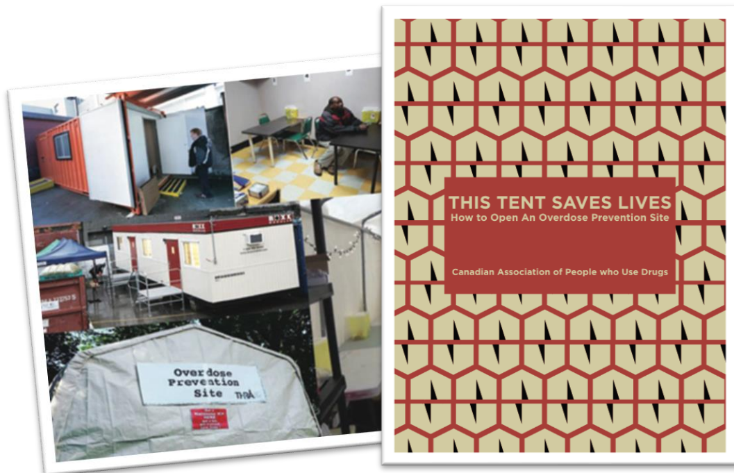
Figure 1: Example of an OPS alongside the guidebook "This Tent Saves Lives" on how to set up a pop-up OPS

Although NSPs are a great starting place for communities, people also need an OPS or SCS where they can safely use their drugs. Since this involves people using both regulated and unregulated drugs, you may need an exemption (federal or provincial) to have a sanctioned site. If your community is in need of a site, CAPUD members and allies wrote a guide book “This Tent Saves Lives” 13 that is a good starting place for how to set up an OPS with little resources