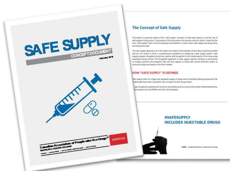
Figure 2: The "Safe Supply Concept Document" outlines of the "safe supply" concept, of what safe supply is, and the role of safe supply in drug policy

Take advice from Dr. Bodkins and Dr. Brothers ‘ Canadian Drug Users Need Us Doctors to Step Up with Safe Supply ’. Until there is a comprehensive national safe supply framework, the majority of PWUD will not have access to safe supply. Therefore, it is necessary for our advocacy efforts to continue. Everyone needs a safe place to use and a safe drug to use. We have to continue to advocate for doctors to do everything in their power to prescribe safe supply, as well as policy makers to do everything in their power to support safe supply. Certified healthcare providers are the ones that have access to the only non-toxic opioid supply, and they should be prescribing the supply to any PWUD who desire a safe supply. Policy makers are the stakeholder that can make this life saving concept sustainable.