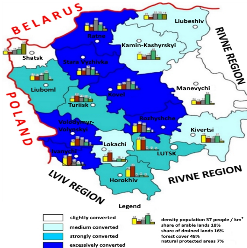
Picture 4. Map of anthropogenic transformation of water balance Volyn region

On the territory of areas with excessive conversion of relief and soils three of the four largest cities in the Volyn region: Lutsk, Volodymyr-Volynsky and Novovolynsk. The most developed agriculture are food, fuel industry and mechanical engineering. The density population is high enough: from 24.3 people / km 2 in Volodymyr-Volyn district (excluding the population of Vladimir-Volynsky) to 65.6 people / km 2 in Lutsk district. On average, this group of areas population is the largest within the region.