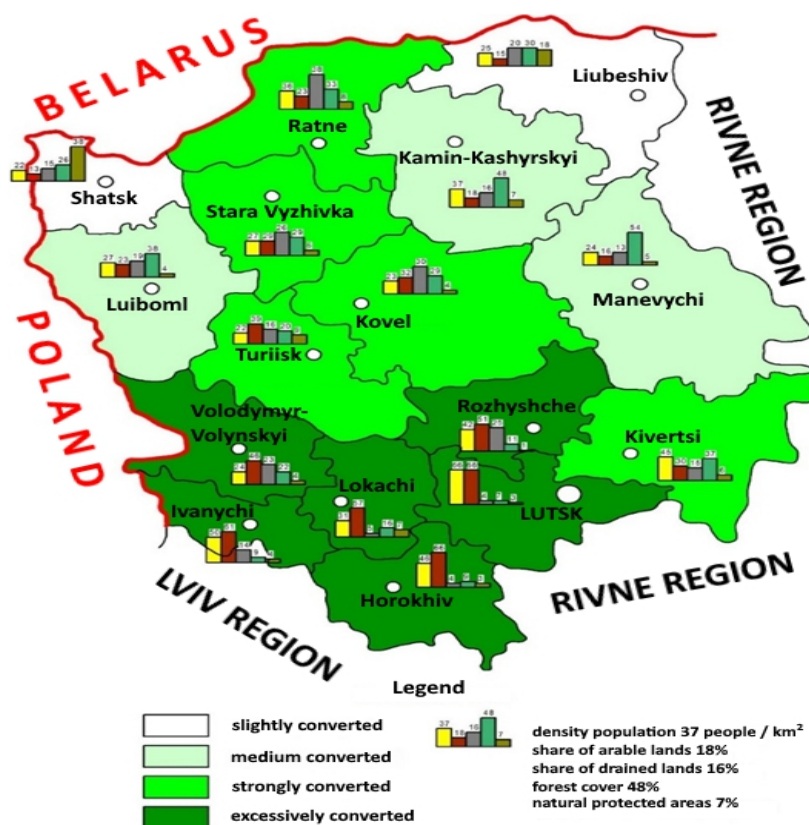
Picture 3. Map of the anthropogenic transformation of relief and soils Volyn region

The largest proportion of arable land together with drained in the Lutsk region 63.73%, the smallest in Volodymyr-Volynsky is 45.08% that is very high-resolution of the territory. The share of drained lands is the smallest in Locaminsky Paradise 7.66% and the largest in Rozhyshechesky is 30.23% (along with meadows). The protected fund of this group of districts