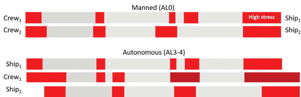
Figure 2. Possible workload stress ratio comparison between manned and autonomous ships.

cumulatively on the order of weeks, months or over a career.