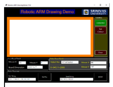
Fig. 3: Application Window