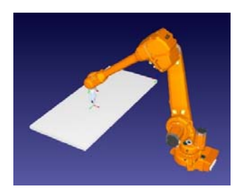
Fig. 2: RoboDK Environment

Now let us see if something happens which is not expected. If not drawing inside the remote board. This error may happen if communication is not established between two applications. In