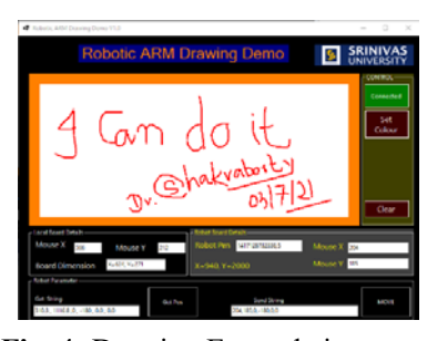
Fig. 4: Drawing Example in apps

our C# application, we provide one connect button. When the application starts, it checks the connection with RoboDK automatically. If the connection succeeds, The Back color of the button turns green. If not, turn red. Most of the time, we forget to start RoboDK first. That is why the error comes frequently. If we see a communication error after running the application starts, we can again press the button to communicate with RoboDK.