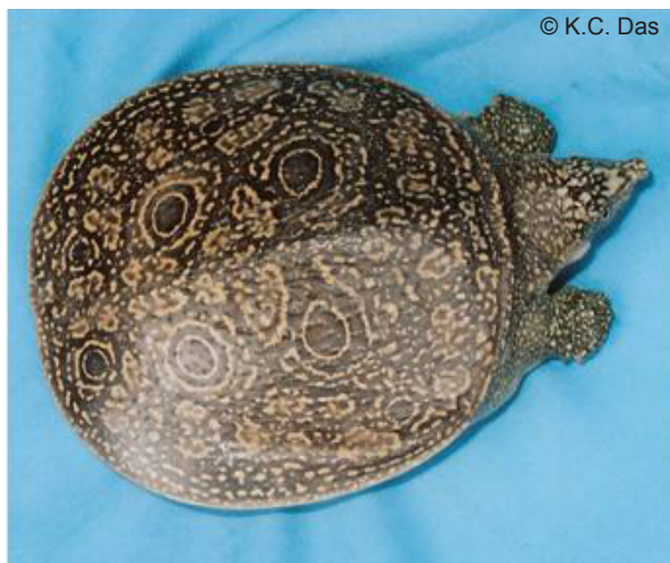
Image 2. Nilssonina hurum