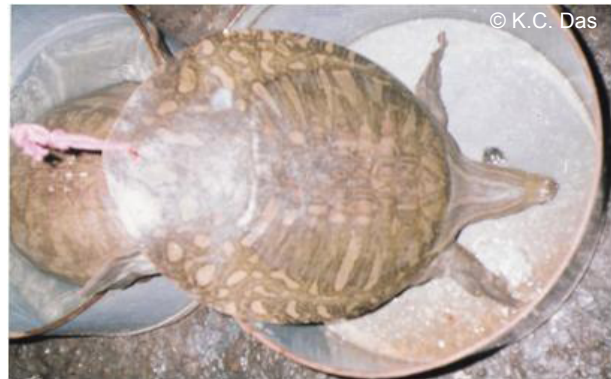
Image 3. Chitra indica