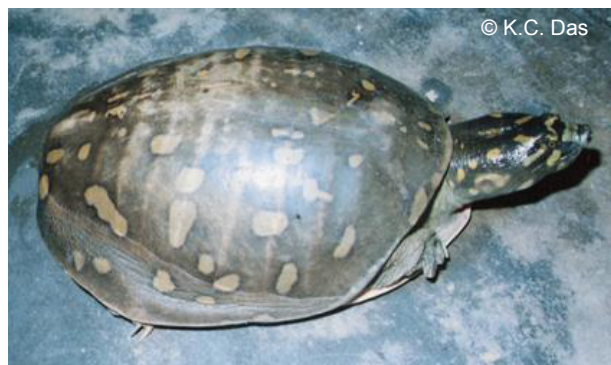
Image 4. Lissemys punctata andersonii