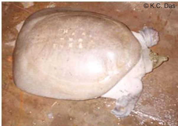
Image 1. Nilssonina gangetica