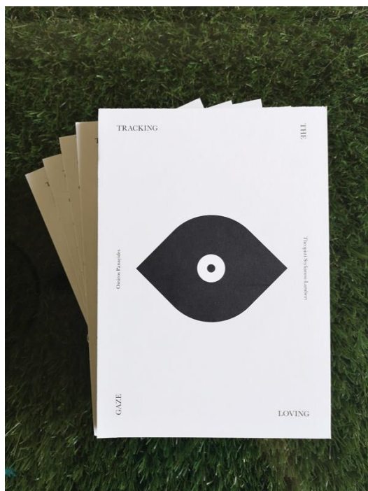
Fig. 7. Tracking the Loving Gaze artist book, 2019. Book design: Philippus Vasiliades (© Omiros Panayides & Theopisti Stylianou-Lambert, 2019).

In 2019, we produced the final part of our project: a limited-edition book in 100 numbered copies (Fig. 6) that includes at the back an original darkroom print (4x6 inch) of a focus map. The book, as a medium, was an intended outcome from the beginning and as such, renegotiates the work that was produced in previous steps, attempting an alternative, more intimate viewing experience of the project.