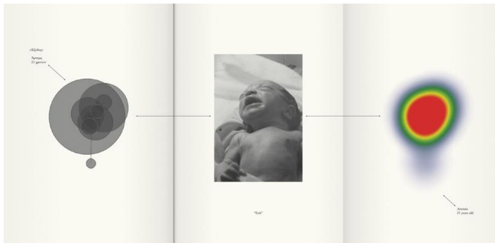
Fig. 8: Tracking the Loving Gaze artist book, 2018, spread of pages 18-20. Book design: Philippos Vasiliades. (© Omiros Panayides & Theopisti Stylianou-Lambert, 2019)

The book engages with the viewing processes of 19 participants by narrating their personal loving gaze with layout decisions using the data collected. The reader of the book is engaged with the personal gaze of each participant and may interpret the final outcome based on his/her own experiences and triggers. As one flips through the book's images, heat maps, tracking paths and pieces of text, he/she fills in the missing parts with personal experiences and memories. For example, in the spread in Fig. 8, the photograph of a newborn baby next to its owner's scan path and heatmap could trigger the reader's personal heatmap/scan path of a comparable experience. By positioning the participant's heat map next to it, we are visualizing the "warm" feeling towards parts of the image, emphasizing what matters most to the owner of the photograph. The reader can sense the intensity and focused attention of the owner of the picture and can connect, however briefly and superficially, with the photograph owner's loving gaze.