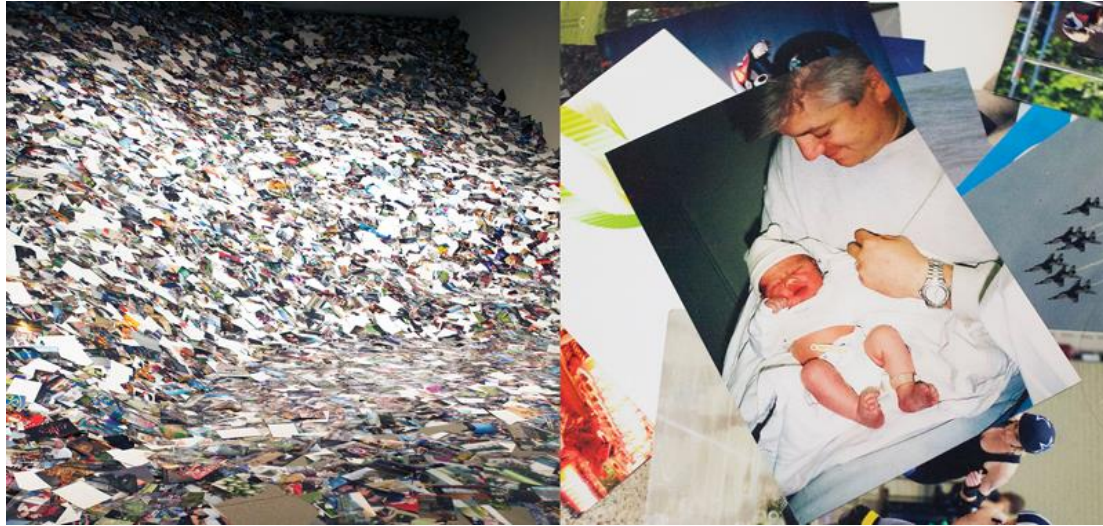
Figs 1a and 1b. Erik Kessels, general view and detail of 24 Hrs in Photos , 2013. At the Secondhand exhibition (1 Aug 2014--31 May 2015), Pier 24 Photography.