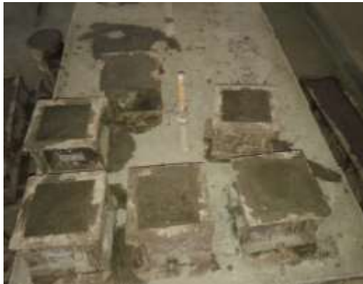
Fig . 2 Casting of cubes

Casting and curing: The fine aggregates, coarse aggregates, fly ash mixed together properly and then alkaline solution are added and mix thoroughly for proper bonding of materials. After properly mixing the cube of size 150\times 150\times 150\text{mm} are casted in layers and each layer is compacted properly. Then cubes are then placed in table vibrator for proper compaction. After proper compaction the casted cubes are kept in oven curing at specified durations and specified temperature accordance to test variable selected. At the end of curing periods, the mould were taken out from oven and allowed to cool down. The test specimen were removed from moulds and left to air dry condition at room temperature condition until tested for direct compression test at specified age of 3 and 7 days.