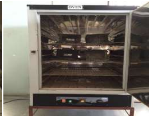
Fig . 3 Oven curing