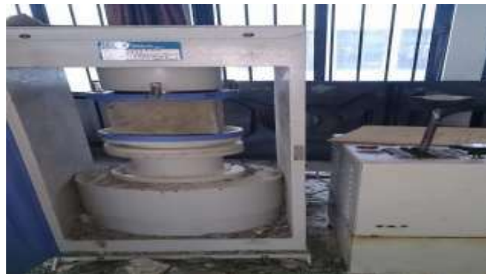
Fig . 4 Testing of Cube under compression testing machine

Compressive strength test: The cube specimens were tested in a compressive testing machine having 2000kN capacity in accordance with the Bureau of Indian Standard test procedures. The compressive strength of geopolymer concrete put at different duration and temperature of curing are shown in graph below. The compressive strength is found out at 3 and 7 days.