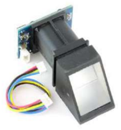
Fig.3 Fingerprint Module R305A

Fingerprint scanner widely used in the today's market for taking the attendance of the Employees, bank security systems. Security lockers & many application in day today life. Storage capacity: 350, Security level-5, False Acceptance Rate (FAR) < 0.001%, False Rejection Rate (FRR) < 0.1%.