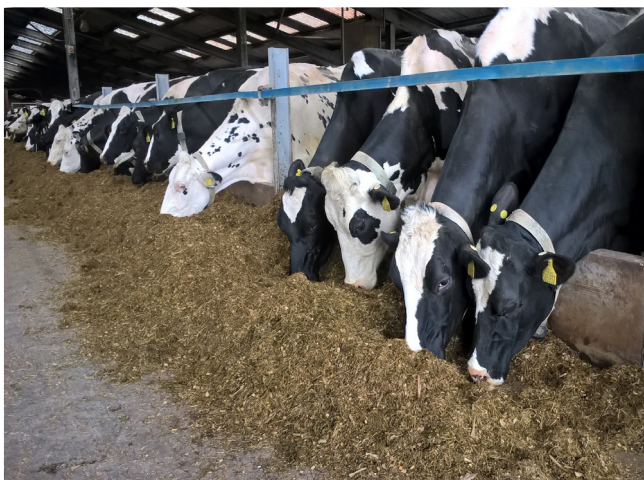
Crichton cows at feed fence.

The protein concentration of lucerne silage (18–22% of dry matter) is significantly higher than that of maize silage (about 8%) and good quality grass silage (14%). This benefit is offset by a lower metabolisable energy content. Farmers can use lucerne to substitute grass silage or maize silage without affecting animal