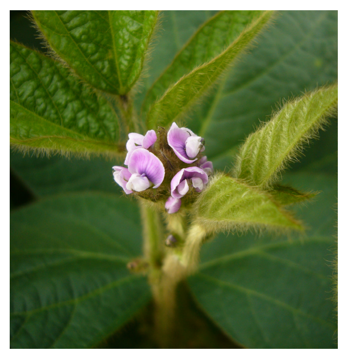
Soybean flower.

Depending on the autumn conditions of a site, harvesting in September is generally preferred while ripening in October runs risks with weather. The growing season from crop emergence in May is therefore short and cultivars that mature quickly are required in most of Europe. The soybean is by nature a so-called short-day and