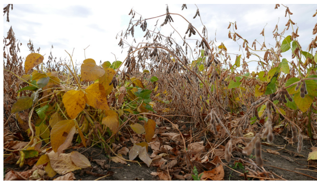
Soybean cultivars with different levels of resistance to lodging on a research plot at the University of Natural Resources and Life Sciences Vienna.

The second selection criterion is the standing stability or the resistance to lodging. This currently varies from grade 2 to 9 (with 1 = lodging verylow to 9 = lodging very high) in the Austrian catalogue. Four grades are used in France (very low risk, low risk, pretty risky, high risk). The risk of lodging is increased by lush growth enabled by a good supply of water. Therefore, cultivars that stand well are preferred where lush, vigorous growth is expected. As a trait, standing ability is often linked to determinate development that shortens the flowering period which in turn reduces the length of the growing period. This leads to early ripening which may in dry years mean a yield disadvantage compared to indeterminate variety types. Crop height is not decisive for resistance to lodging. Tall cultivars tend to have fewer pods placed close to the soil. This results in lower harvest losses, especially where a flexible cutterbar is not used.