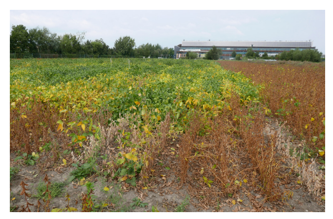
Soybean cultivars of different maturity groups on a research plot at the University of Natural Resources and Life Sciences Vienna.

Because the maturity group categorisation is only approximate, some descriptive cultivar lists go further and indicate a number of more or fewer days for maturity compared to a cultivar serving as a reference. This is done in Switzerland, Czechia, France, Hungary and Poland. Description lists in Austria and Germany provide numbers to distinguish between relatively early, medium and late cultivars within a maturity group. In Austria, earliness ratings 2-3-4 are allocated to MG 000 and 5-6-7 to MG 00. These more precise ratings consider the impact of the local effects of temperature and water supply on earliness. Local testing of candidate cultivars to examine these fine responses helps in local selection.