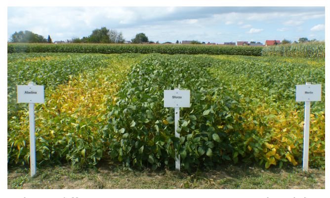
Cultivar differences in ripeness, vigour and stability.