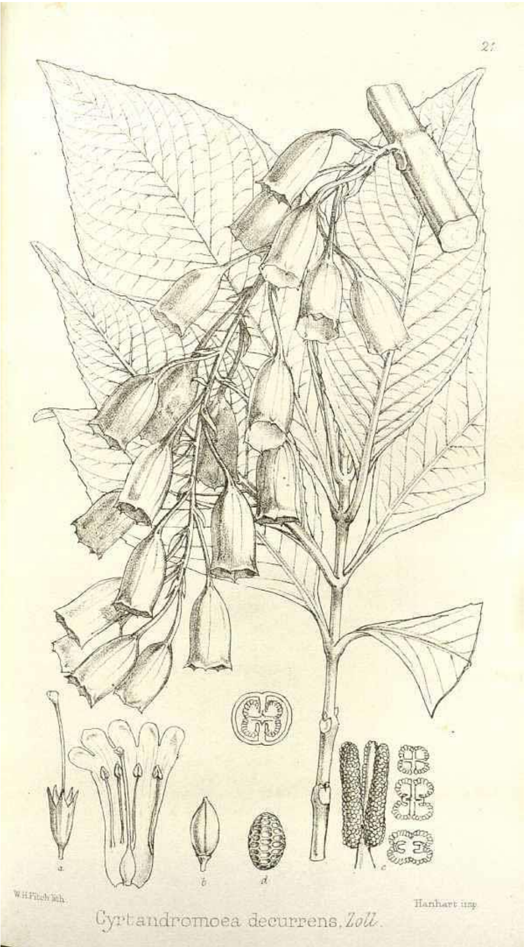
FIG. S2. Illustration of generic type of Cyrtandromoea decurrens (Bl.) Zoll..