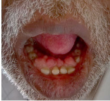
Figure 2: Lingual view of lower gingival overgrowth

The patient underwent dental procedures including scaling and was shifted to labetalol 100 mg twice daily for the further management of hypertension. On reassessment after six weeks, a drastic improvement in the clinical picture of gingiva was noted with complete resolution of inflammation.