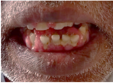
Figure 1: Facial view of extensive lower buccal gingival overgrowth