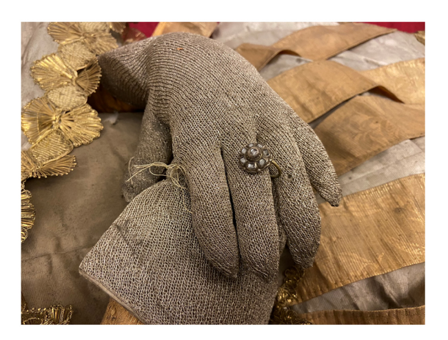
Figure 36. Corposanto relic-sculpture of St. Bonifacus. Human remains (skeletal fragments), metal wire, wood, wax, textile, polychromy, laid paper, and mixed materials. Second half of the eighteenth century (post 1765), altered late nineteenth century. Formerly Franciscan convent in Valkininkai. Valkininkai Parish Church, Lithuania.