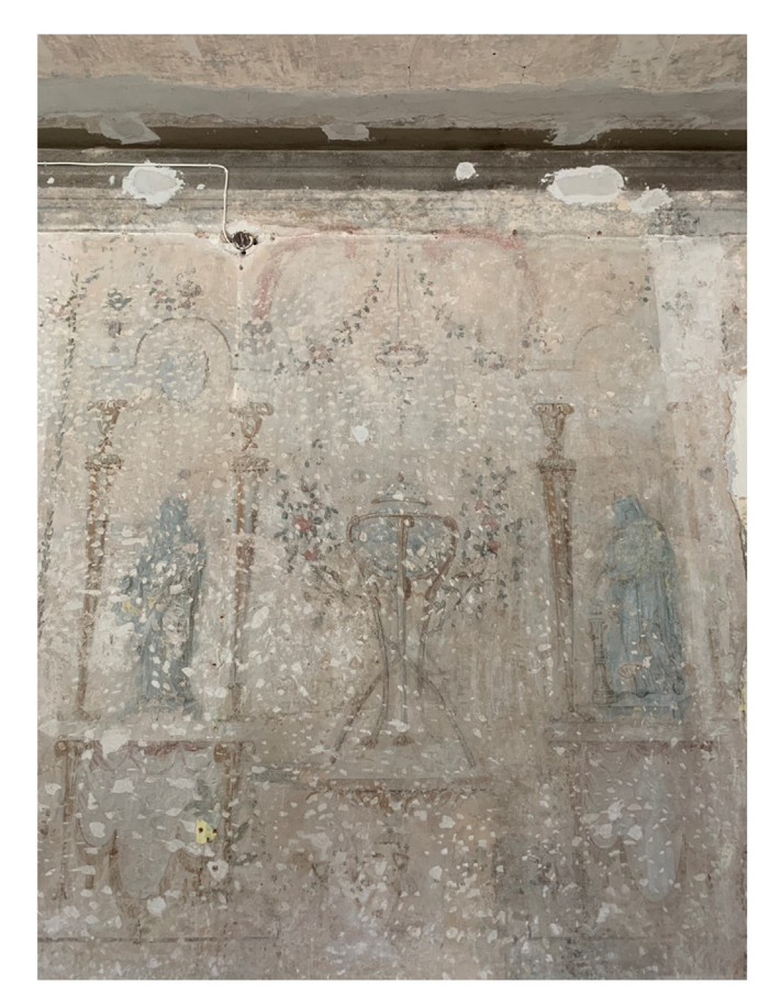
Figure 18. Unknown artist, trompe-l'oeil mural painting with classical statues, grotesques, festoons, and tripod. Turn of the nineteenth century, circa 1783–1810. Borch manor palace, Varakļāni, Latvia.