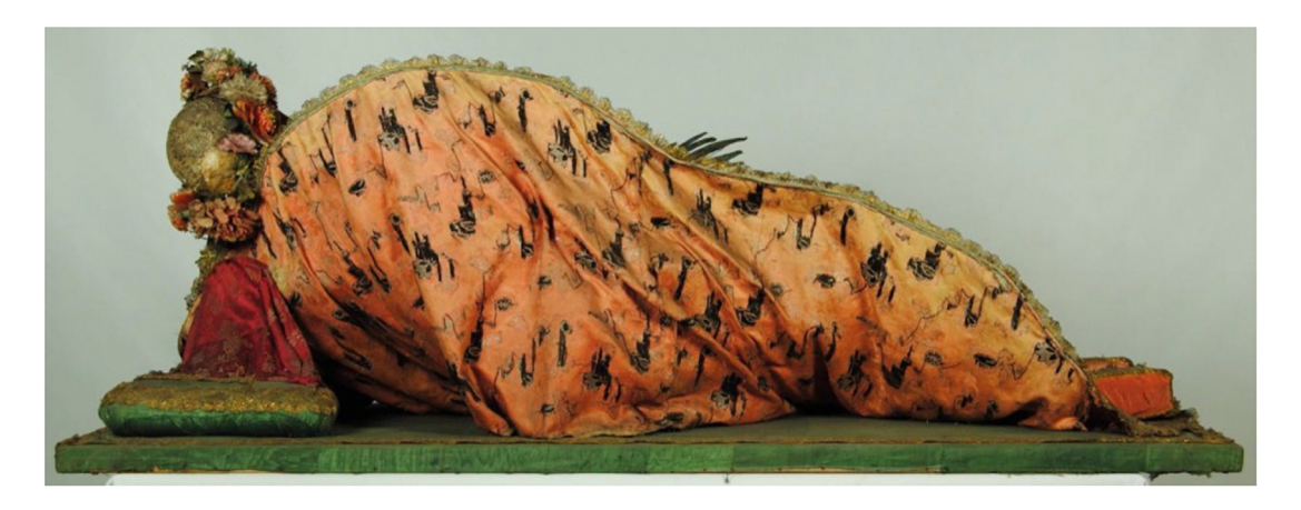
Figure 13. Corposanto relic-sculpture of St. Aurelius, dorsal view. Human remains (skeletal fragments), metal wire, wood, wax, textile, polychromy, laid paper, and mixed materials. Circa 1789. Cathedral of Porto, Portugal. This figure has been reproduced with permission from: Joana do Carmo Palmeirão, "Imagem-relicário de Santo Aurélio mártir pertencente à Sé Catedral do Porto. Estudo e conservação integrada das relíquias," MA thesis, Universidade Católica Portuguesa, 2015, 153, fig.2.