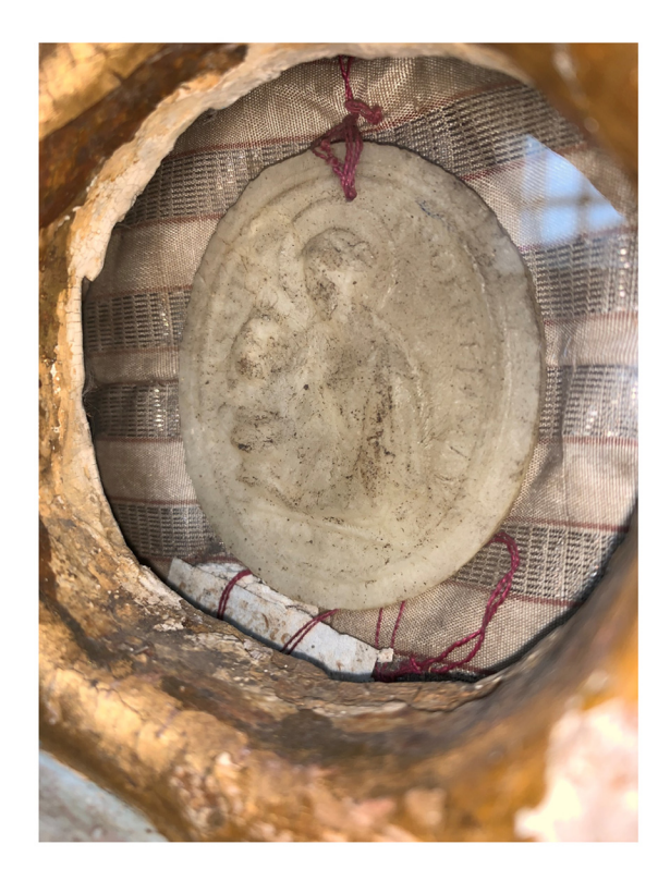
Figure 8. Reliquary busts containing pasta di reliquie and catacomb relics, detail. Human remains (skeletal fragments), polychromed wood, wax, textile, and mixed materials. Second half of the eighteenth century ( post 1765). Formerly Franciscan convent in Valkininkai. Church Heritage Museum, Vilnius, Lithuania.

first decades of the 1600s, Jesuits divided between the Provinces of Poland and Lithuania around 80 catacomb bodies imported from Rome; after 1631 some of these relics were translated into three Jesuit churches, a private chapel, and the cathedral in Vilnius. Other catacomb relics were installed in the chapel (and subsequently to the parish church and Jesuit church) of the new Jesuit college of Kražiai (Pol. Kroże) in the region of Samogitia (Pol. Żmudź, Lith. Žemaitija); those of saints Crescentius, Clemens, Martinianus, Martiniana, Emiliana, and Faustina were brought to Samogitia ante 1639. In the north-eastern Lithuanian diocese of Smolensk (today in Russia) the body of catacomb saint Callistratus was donated to Smolensk cathedral church circa 1645, under the aegis of the powerful magnate and Great Standard-Bearer of Lithuania, Nicolas (Mikołaj) Sapieha (1581-1644), who also brought four such bodies to his residence in Kodeń (in contemporary eastern Poland) in the 1630s after a trip to Rome. Around 1751 the body of the catacomb saint Fortunatus was brought to Samogitia cathedral in Varniai (Pol. Wornie)42. Relics of St. Valens extracted from the catacombs of Trasone and Saturnino in 1763 were translated on the occasion of the installation in the Trinitarian Church in Vilnius in 1765 under Vilnius Bishop Ignacy Jakub Massalski43.