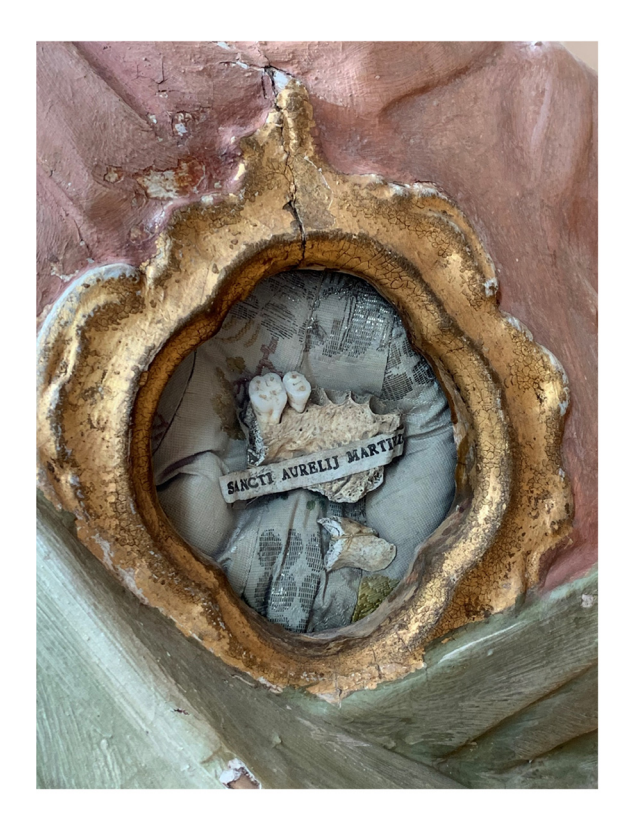
Figure 5. Catacomb reliquary bust of St. Aurelius, detail. Human remains (skeletal fragments), polychromed wood, textile, and mixed materials. Second half of the eighteenth century. Formerly Franciscan convent in Valkininkai. Church Heritage Museum, Vilnius, Lithuania.