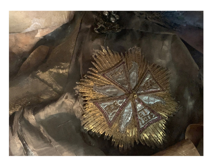
Figure 40. Corposanto relic-sculpture of St. Bonifacus. Human remains (skeletal fragments), metal wire, wood, wax, textile, polychromy, laid paper, and mixed materials. Second half of the eighteenth century (post 1765), altered late nineteenth century. Formerly Franciscan convent in Valkininkai. Valkininkai Parish Church, Lithuania.