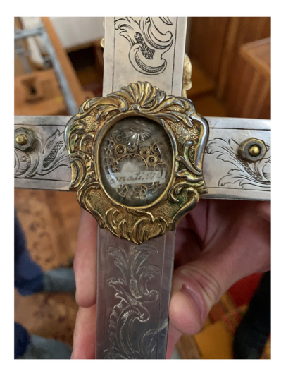
Figure 23. Crucifix with reliquary theca containing St. Donatus relics. Silver, gilding, modern hardware. Late eighteenth century. St. Louis Church, Krāslava, Latvia.

The status of the Plater's church and latifundia radically changed subsequent to the first partition of 1772, as Krāslava became