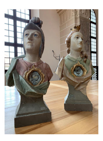
Figure 3. Catacomb reliquary busts of St. Aurelius (left) and St. Victoria (right), frontal view. Human remains (skeletal fragments), polychromed wood, textile, and mixed materials. Second half of the eighteenth century. Formerly Franciscan convent in Valkininkai. Church Heritage Museum, Vilnius, Lithuania.