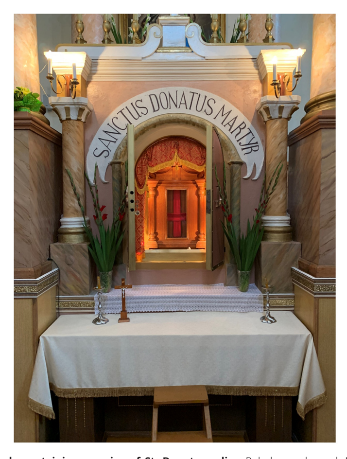
Figure 22. Reliquary tabernacle containing remains of St. Donatus relics. Polychromed wood. Mid-twentieth century. St. Louis Church, Krāslava, Latvia.