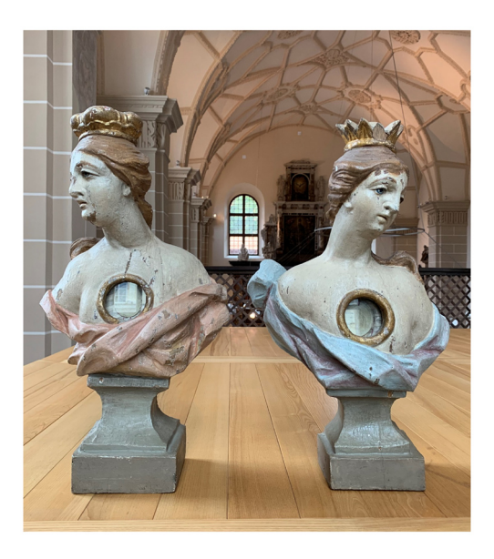
Figure 7. Reliquary busts containing pasta di reliquie and catacomb relics, frontal view. Human remains (skeletal fragments), polychromed wood, wax, textile, and mixed materials. Second half of the eighteenth century ( post 1765). Formerly Franciscan convent in Valkininkai. Church Heritage Museum, Vilnius, Lithuania.