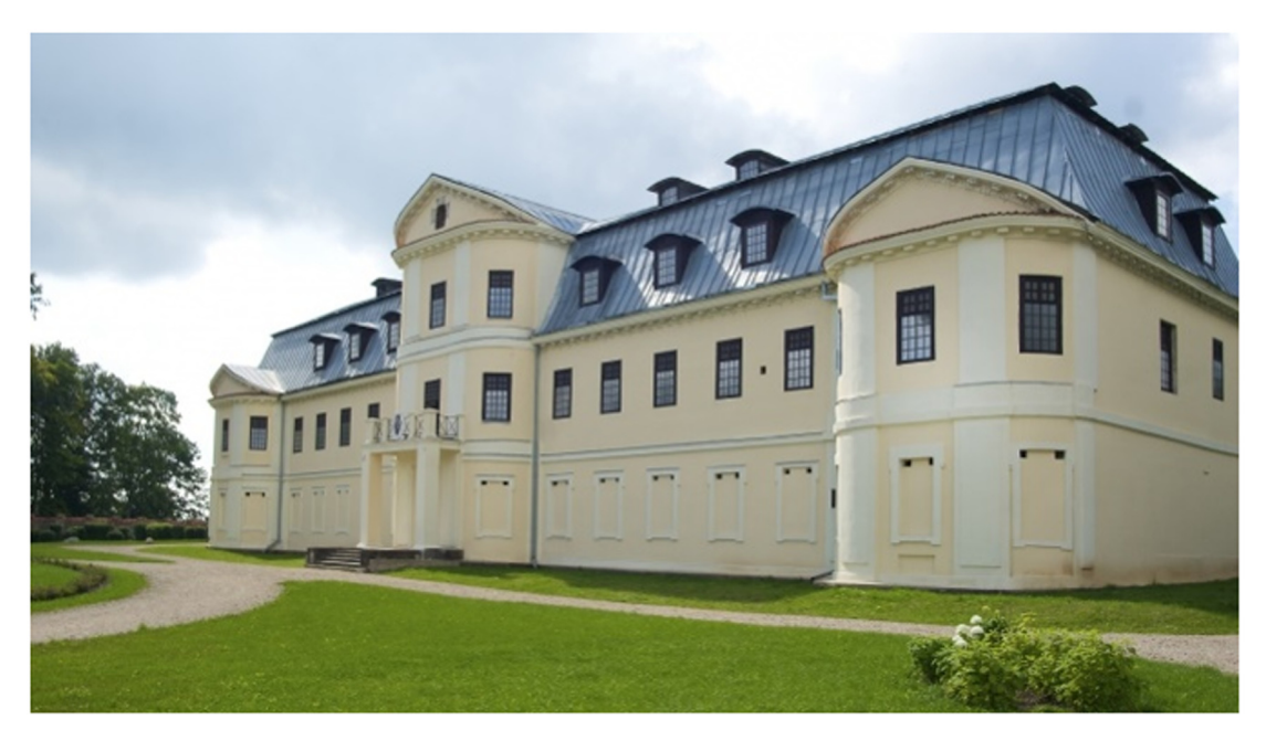
Figure 29. Plater manor palace. Begun c. 1760. Krāslava, Latvia. Image: Ruth Sargent Noyes.

Konstanty Plater's widow Augusta Ogińska (1724–91), whose testament accorded funds for construction of the Donatus chapel and beneath it a subterranean family crypt, a design that gestured to the promise of resurrection through its physical alignment of the decaying corpses of deceased Plater family members with the artificially reintegrated body of their special saint<sup>117</sup> (see extended data Appendix 4).