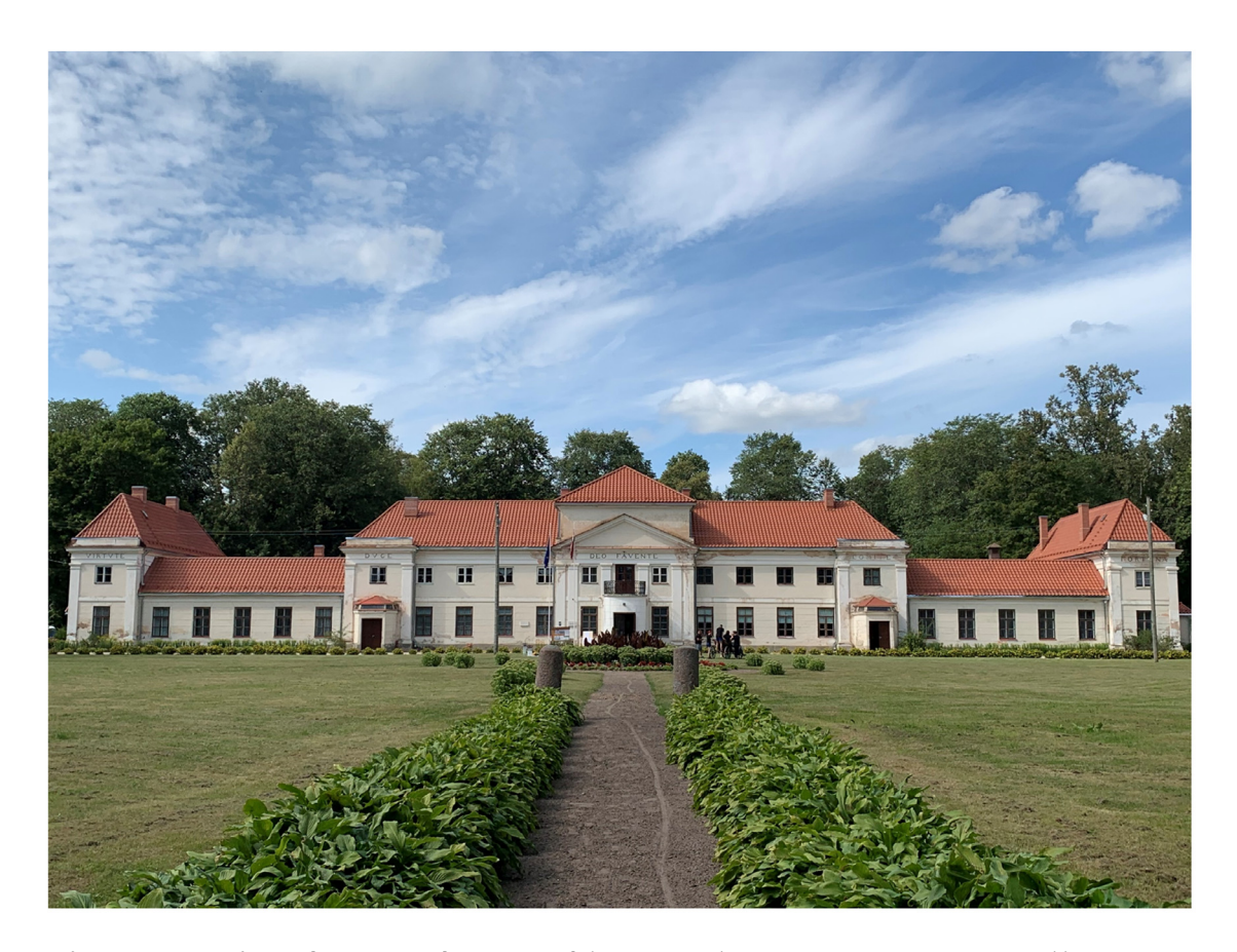
Figure 15. Vincenzo Mazotti, Borch manor palace. Turn of the nineteenth century, circa 1783–1810. Varakļāni, Latvia. Image: Ruth Sargent Noyes.