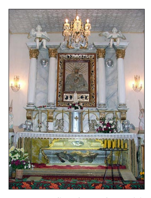
Figure 41. Corposanto relic-sculpture of St. Justinian. Human remains (skeletal fragments), metal wire, wood, wax, textile, polychromy, laid paper, and mixed materials. Second half of the eighteenth century (post 1754). Formerly Church of the Discalced Carmelites in Old Myadzyel. Mosar Parish Church, Belarus.

<sup>134</sup> The precise location of this starostwo remains to be identified.