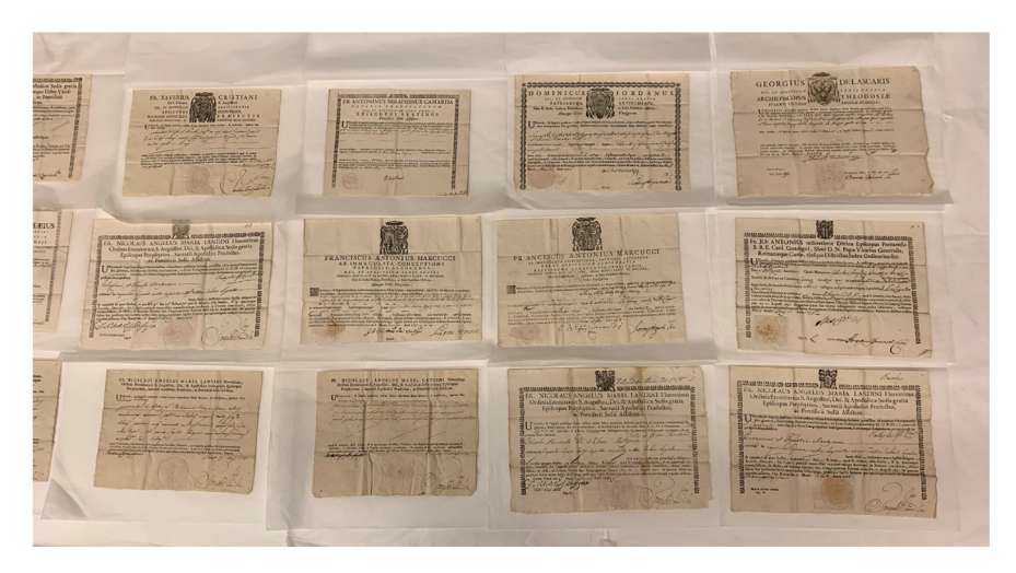
Figure 9. Authentic certificates. Seventeenth-nineteenth centuries. Ink on laid rag paper. Church Heritage Museum, Vilnius, Lithuania.

Cemeteries on behalf of the Vicar-General in 1763, Authentics also furnished a validating description of the relics and the container into which they were placed, and specified from which cemetery the remains were taken and to whom they were entrusted<sup>67</sup> (Figure 10).