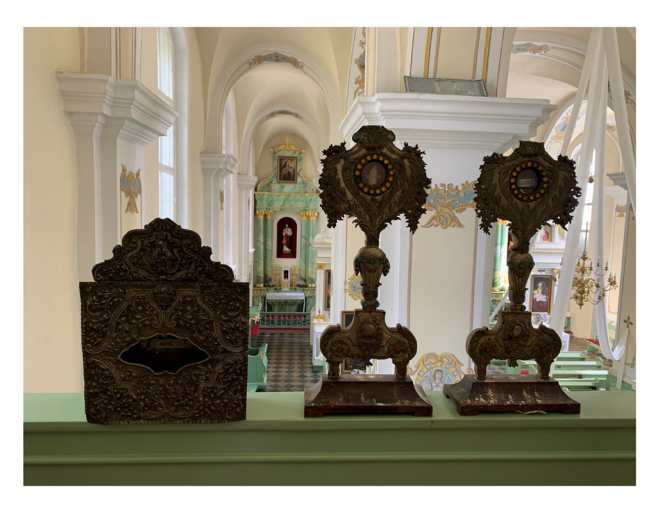
Figure 6. Catacomb relic galleries. Mid- to late-eighteenth century. Human remains (skeletal fragments), wood, metal, and mixed materials. Mid-eighteenth century. Parish church, Viļāni, Latvia.

widespread spoliation of relics from altars, and the burgeoning quantity of miniscule relics issuing from the catacombs to satisfy burgeoning demand<sup>39</sup>. Yet another solution to the problems of friable relics that proliferated in the eighteenth century were so-called pasta di reliquie ("relic paste") objects, manufactured by mixing pulverized bones into a paste and molding this substance into miniature sculptures, as in two examples installed in two reliquary busts, also originally from Valkininkai, which combined these molded objects with small catacomb relic fragments<sup>40</sup> (Figure 7–Figure 8).