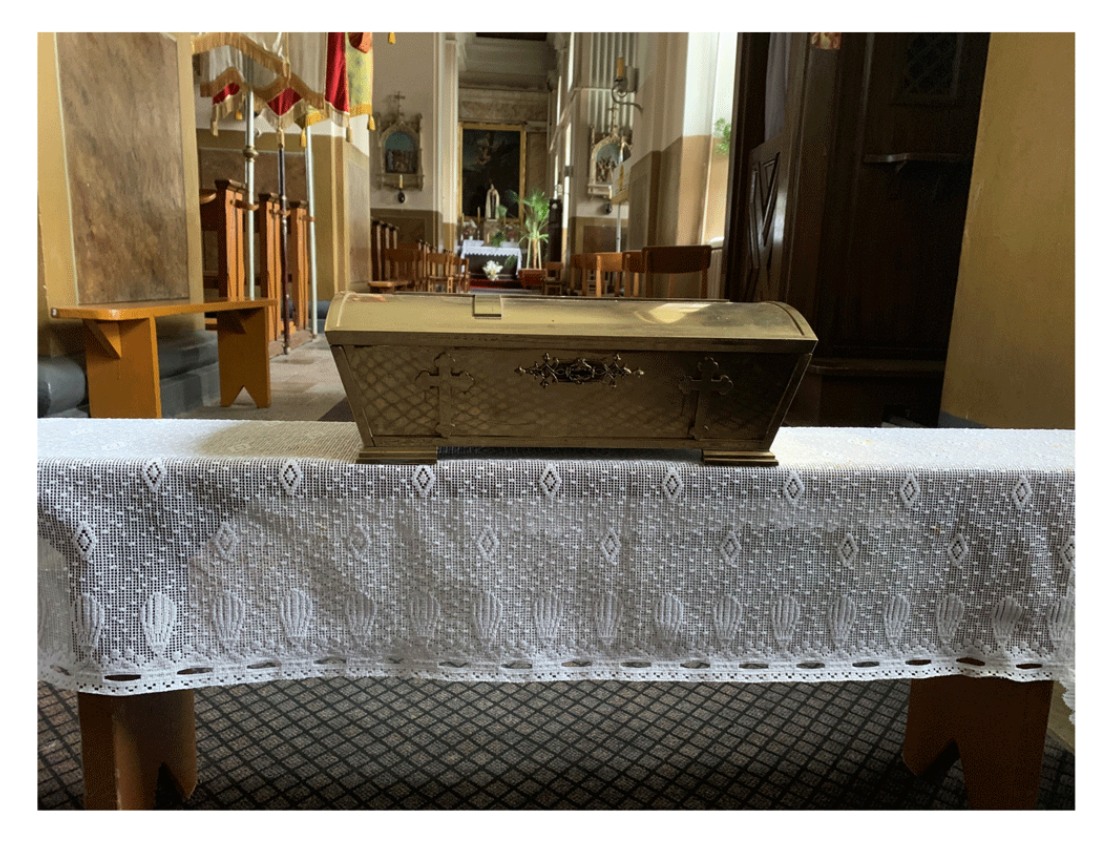
Figure 21. Inner reliquary coffin containing remains of St. Victor relics. Metal (likely brass). Early- to mid-twentieth century. Varakļāni parish church, Latvia. Image: Ruth Sargent Noyes.

Under Count Konstanty Ludwik Plater (1722-78) and his son Kazimierz Konstanty Plater (c. 1749-1807), the Plater staged a renovation of the region's spiritual and political landscape that proved chameleon-like in its adaptability to changing conditions on the ground and would later serve as a model for regional development emulated by Michał Jan Borch at Varaklāni<sup>108</sup> (Figure 26-Figure 27). Notably, Kazimierz Konstanty Plater married Borch's sister Izabela Ludwika Borch (1752-1813), closely linking the two families 109. Begun as a series of prestigious building projects with the aim of transforming Krāslava's status to become the new seat of the Bishopric of Livonia, the Plater's campaign entailed a series of projects in art, architecture and the built environment focused around the town that included a Catholic church dedicated to St. Louis IX (1214–70), pious medieval French monarch, famed Holy Land crusader and collector of relics, and likely designed by the