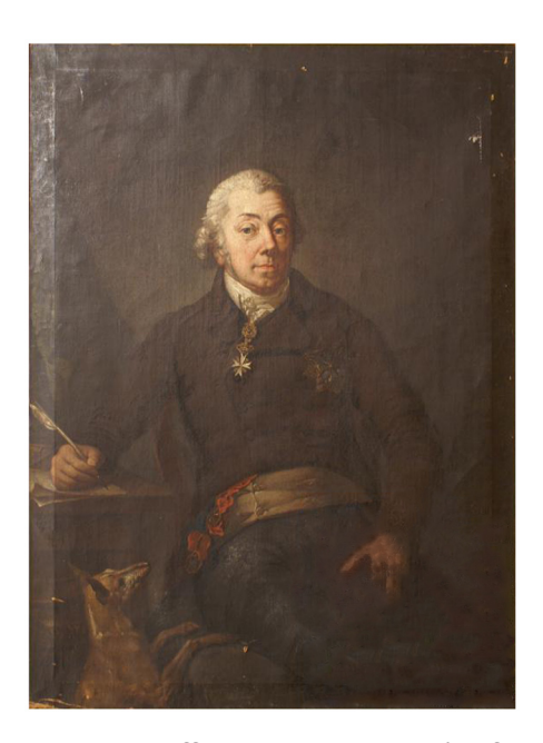
Figure 27. Anton Graff (1736–1813), portrait of Kazimierz Konstanty Plater. Circa 1800. Oil on canvas. The Smolensk State Museum-Preserve, Smolensk, Russia.

Thus Borch's own request four years later for the corposanto of St. Victor and a true Cross relic was apparently made in direct imitation of what his Plater relations had previously obtained with Castaldi's help. Indeed, the relic-sculpture of St. Donatus imported to Krāslava likewise represented an ancient Roman soldier martyred for the faith<sup>115</sup>. Like Borch at Varakļāni, the Plater only oversaw the official translatio of St. Donatus to Krāslava's new church in 1784, the year following Pius's aforementioned Bull "Onerosa pastoralis." Before this, they first kept the relic-sculpture in the private chapel inside their palace, surrounded by mural paintings of Roman vedute and architectural quadrature executed by Castaldi after prints by Gianbattista Piranese, likely souvenirs of his Roman mission for the Plater<sup>116</sup> (Figure 29–Figure 31).