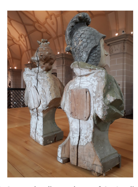
Figure 4. Catacomb reliquary busts of St. Aurelius (right) and St. Victoria (left), dorsal view. Human remains (skeletal fragments), polychromed wood, textile, and mixed materials. Second half of the eighteenth century. Formerly Franciscan convent in Valkininkai. Church Heritage Museum, Vilnius, Lithuania.