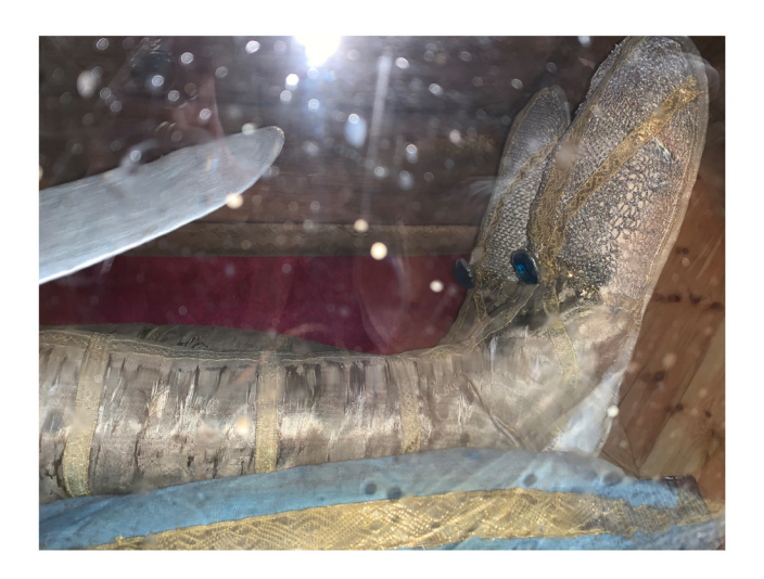
Figure 35. Corposanto relic-sculpture of St. Bonifacus. Human remains (skeletal fragments), metal wire, wood, wax, textile, polychromy, laid paper, and mixed materials. Second half of the eighteenth century ( post 1765), altered late nineteenth century. Formerly Franciscan convent in Valkininkai. Valkininkai Parish Church, Lithuania.