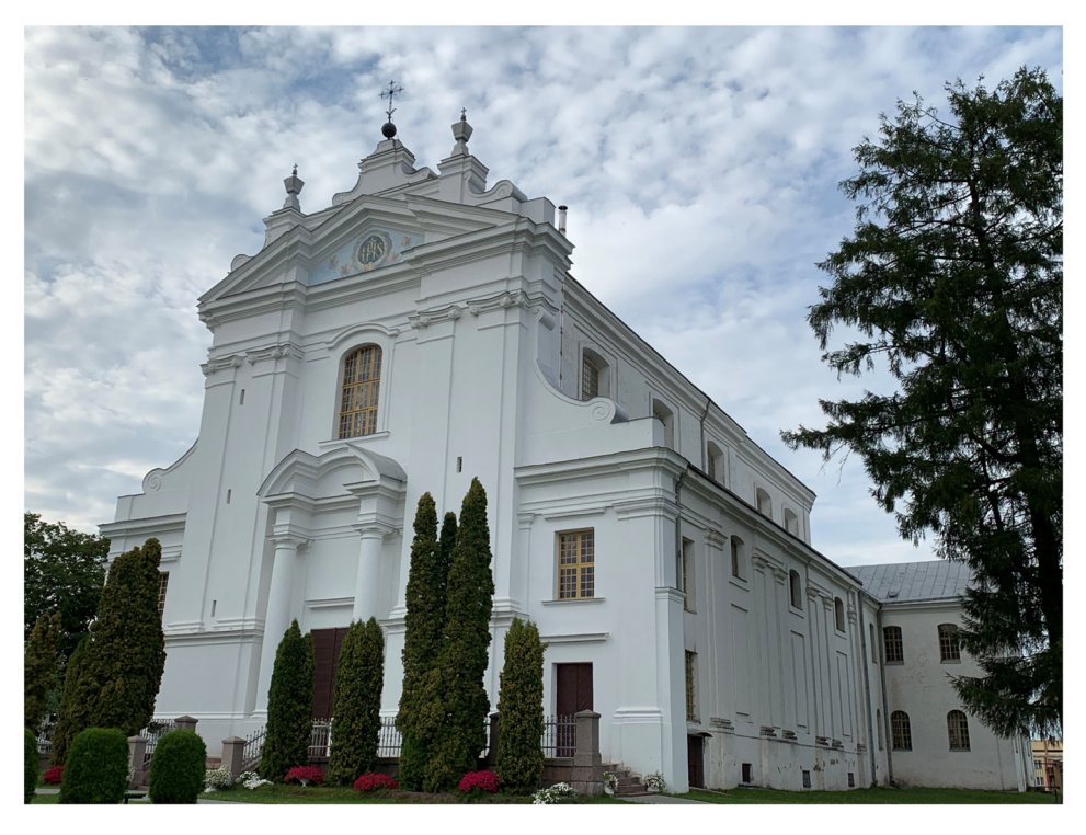
Figure 28. Antonio Ludovico Paracca (1722-c. 1790), Church of St. Louis (attributed). Circa 1755–1767. Krāslava, Latvia.