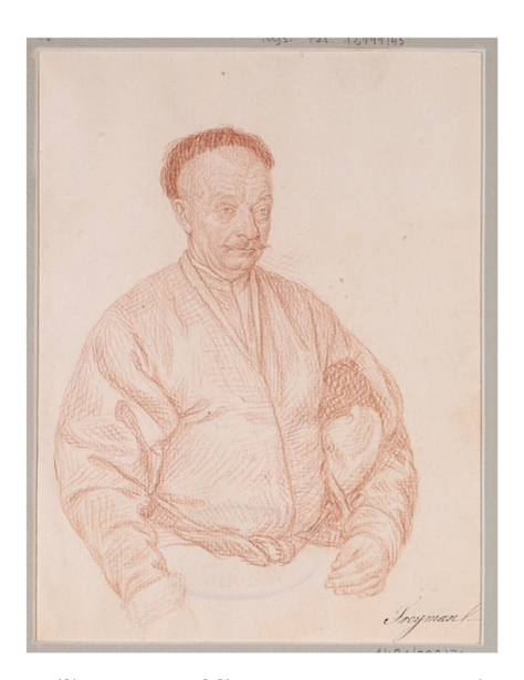
Figure 26. Filippo Castaldi (1734–1814), portrait of Count Konstanty Ludwik Plater. Circa 1778. Sanguine (Red chalk) on paper. Album Obywateli Inflant, Rys.Pol.12141, National Museum, Warsaw, Poland. This figure has been reproduced with permission from: courtesy of Department of prints and drawings, National Museum.