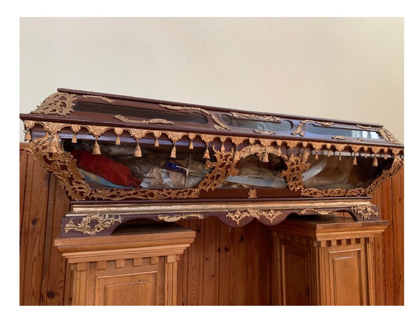
Figure 14. Corposanto relic-sculpture of St. Bonifacus. Human remains (skeletal fragments), metal wire, wood, wax, textile, polychromy, laid paper, and mixed materials. Second half of the eighteenth century ( post 1765), altered late nineteenth century. Formerly Franciscan convent in Valkininkai. Valkininkai Parish Church, Lithuania.