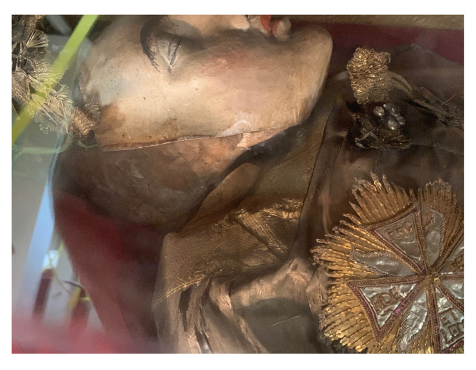
Figure 34. Corposanto relic-sculpture of St. Bonifacus. Human remains (skeletal fragments), metal wire, wood, wax, textile, polychromy, laid paper, and mixed materials. Second half of the eighteenth century (post 1765), altered late nineteenth century. Formerly Franciscan convent in Valkininkai. Valkininkai Parish Church, Lithuania.