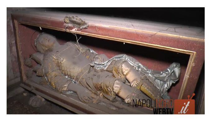
Figure 2. Corposanto relic-sculpture of St. Feliciano. Human remains (skeletal fragments) and mixed materials. Circa 1795. Palazzo Pinelli, Giugliano in Campania (Naples), Italy.