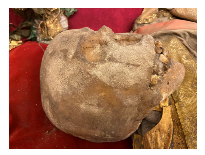
Figure 39. Corposanto relic-sculpture of St. Bonifacus. Human remains (skeletal fragments), metal wire, wood, wax, textile, polychromy, laid paper, and mixed materials. Second half of the eighteenth century (post 1765), altered late nineteenth century. Formerly Franciscan convent in Valkininkai. Valkininkai Parish Church, Lithuania.