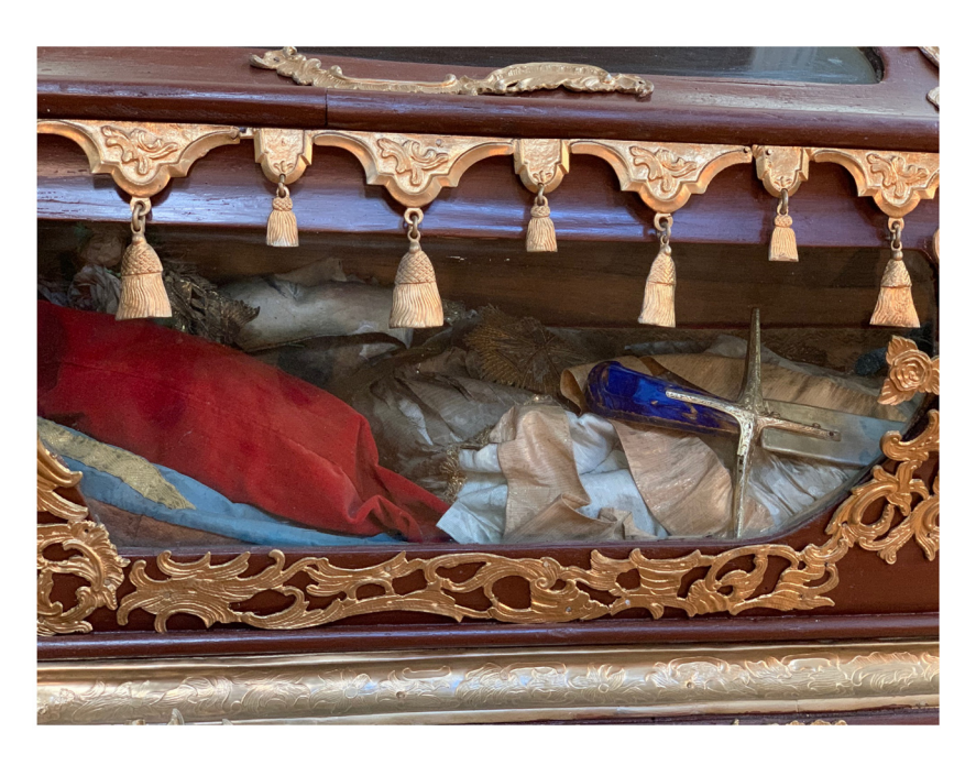
Figure 33. Corposanto relic-sculpture of St. Bonifacus. Human remains (skeletal fragments), metal wire, wood, wax, textile, polychromy, laid paper, and mixed materials. Second half of the eighteenth century ( post 1765), altered late nineteenth century. Formerly Franciscan convent in Valkininkai. Valkininkai Parish Church, Lithuania.