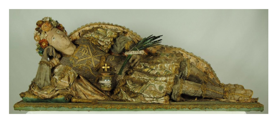
Figure 12. Corposanto relic-sculpture of St. Aurelius, frontal view. Human remains (skeletal fragments), metal wire, wood, wax, textile, polychromy, laid paper, and mixed materials. Circa 1789. Cathedral of Porto, Portugal. This figure has been reproduced with permission from: Joana do Carmo Palmeirão, "Imagem-relicário de Santo Aurélio mártir pertencente à Sé Catedral do Porto. Estudo e conservação integrada das relíquias," MA thesis, Universidade Católica Portuguesa, 2015, 153, fig.1.