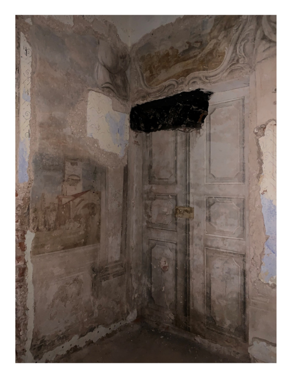
Figure 30. Filippo Castaldi, mural paintings of landscape vedute and trompe-l'oeil of classical statues and architectural quadratura. Post 1760. Plater manor palace, Krāslava, Latvia.