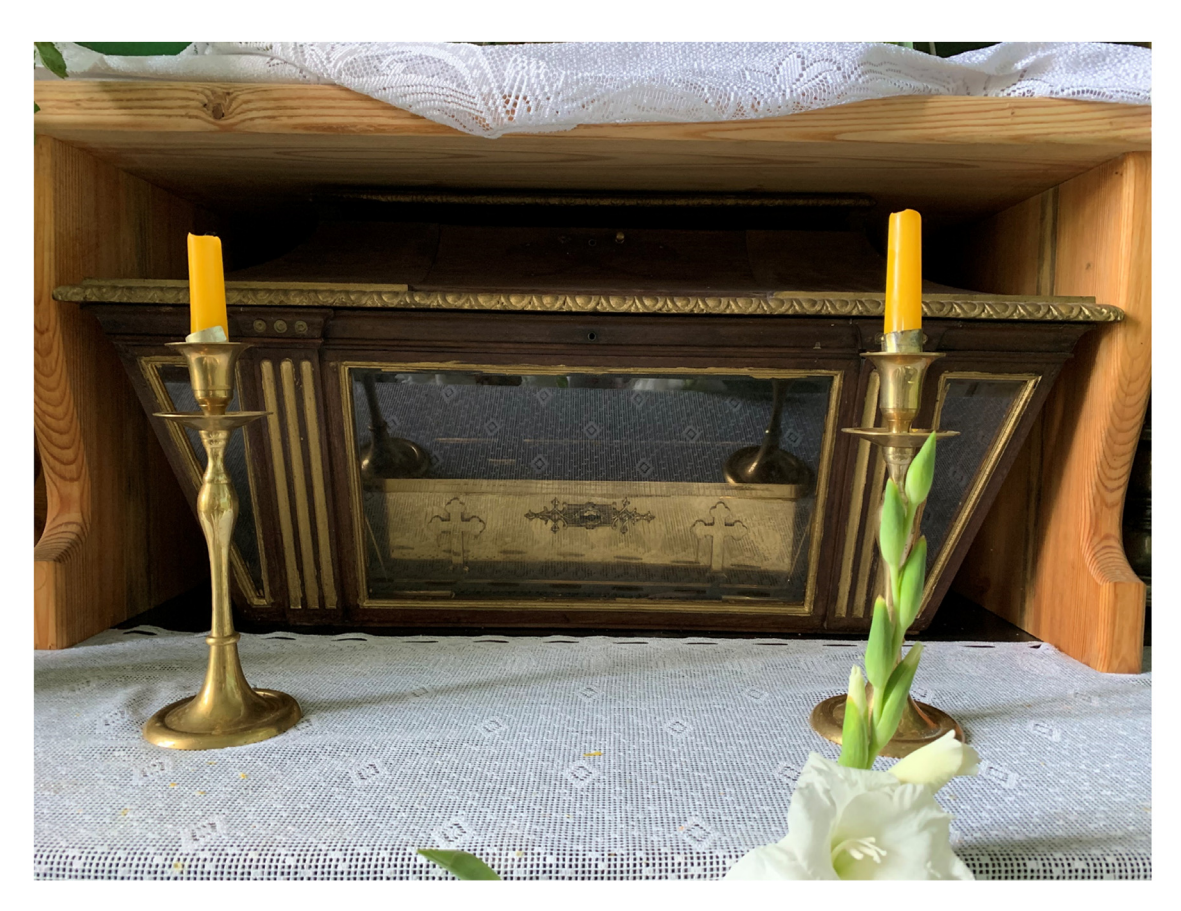
Figure 20. Outer reliquary coffin containing remains of St. Victor relics. Polychromed wood and glass. Early- to mid-twentieth century. Varakļāni parish church, Latvia.