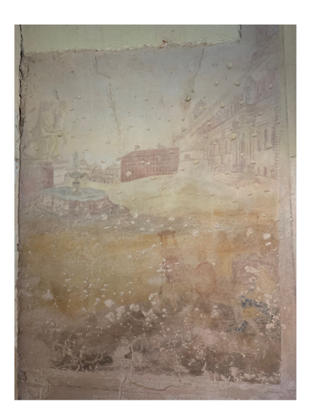
Figure 31. Filippo Castaldi, mural painting veduta of the Palazzo Quirinale, Rome. Post 1760. Plater manor palace, Krāslava, Latvia. Image: Ruth Sargent Noyes.

devotional booklet and a sermon delivered on the occasion<sup>123</sup> (see extended data, Appendix 5). Both printed in Vilnius on the Franciscan presses, these hagiographies signal efforts invested in promoting the broader importance of the catacomb saint's nascent cult on both a regional and national level in Lithuania. Ogiński was furthermore responsible for the catacomb relics of St. Teofilus (or Theophilus), translated in 1680 in a silver coffin to the Church of St. Johns in Vilnius; and others of unnamed saints in 1768 to the Trinitarian monastery in Maladzyechna (Pol. Mołodeczno), a town in the Minsk Vovoideship (today in Belarus) purchased by the family early in the century<sup>124</sup>. These three strategically located locations manifested the magnates' power and presence throughout the Grand Duchy, from its capital to its provinces, and cast a numinous net across their far-flung territories that reified a transhistorical notion of translatio imperii, whereby the glory and sacral power of Rome might be transferred to the far north, a concept nurtured in historiographical discourse of this period<sup>125</sup>.