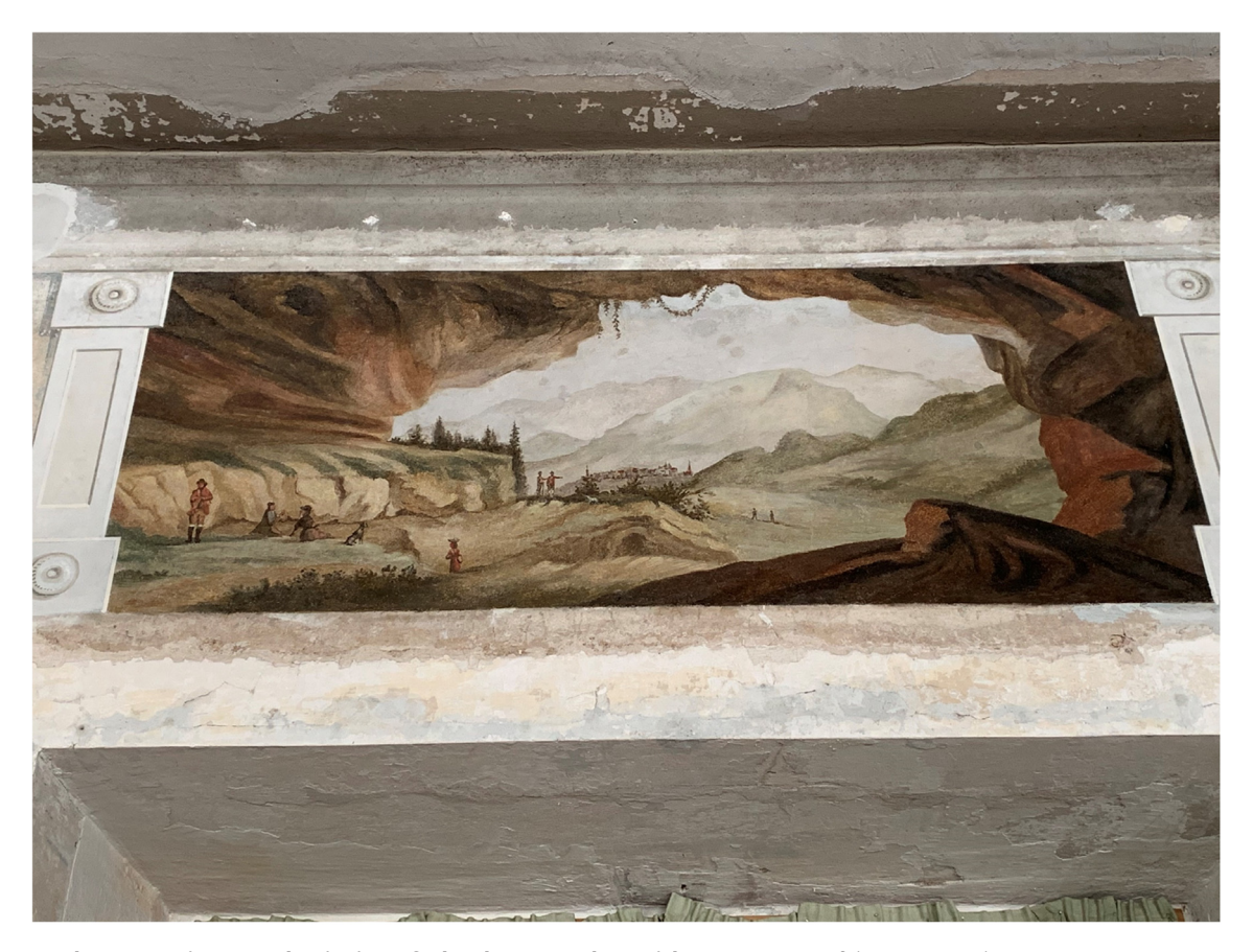
Figure 16. Unknown artist, mural painting of a landscape veduta with grotto. Turn of the nineteenth century, circa 1783–1810. Borch manor palace, Varakļāni, Latvia.