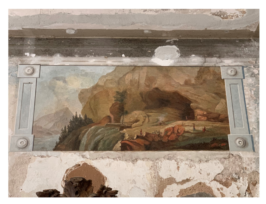
Figure 17. Unknown artist, mural painting of a landscape veduta with grotto. Turn of the nineteenth century, circa 1783–1810. Borch manor palace, Varakļāni, Latvia.