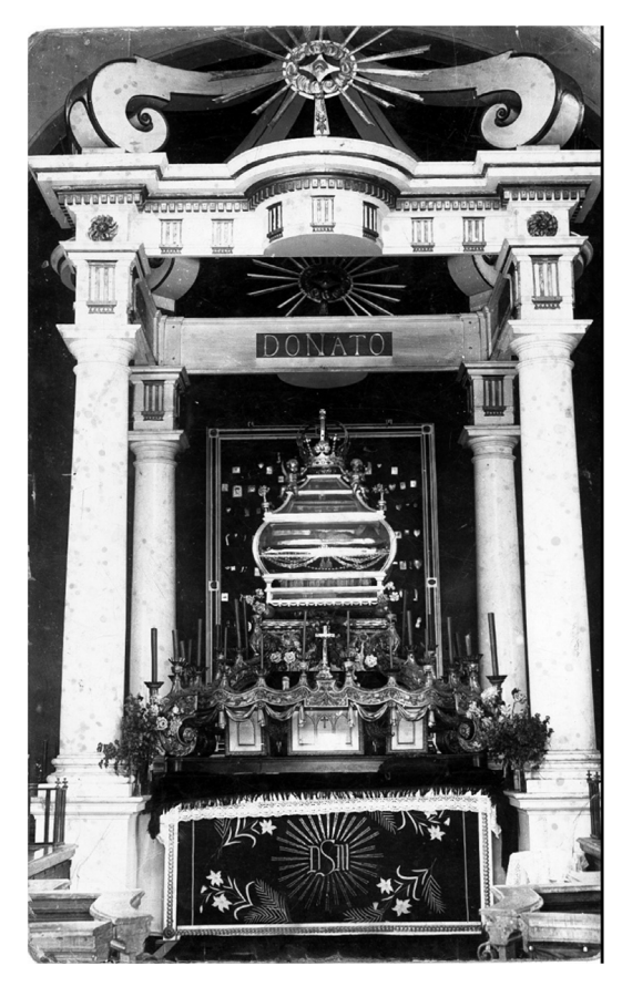
Figure 24. St. Donatus Chapel. Early- to mid-nineteenth century (photo circa 1920s, installation pre-1944). St. Louis Church, Krāslava, Latvia.