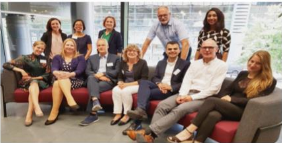
Stakeholders Committee (SC) Meeting in Brussels on June 21 st

This Newsletter is part of the European Joint Programme One Health EJP, his project has received funding from the European Union's Horizon 2020 research and innovation programme under Grant Agreement No 773830