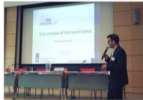
Expert's meeting - 4 and 5 June 2018

WP2 Integrative Strategic Research Agenda - Before the start of the EJP, a strategic research agenda (SRA) was prepared to run the first call for projects within the consortium. In order to prepare the second call for projects, WP2 has been drafting an updated version of the SRA after expert consultation. The interfaces with the EU funded projects has been defined and the priority topics of EFSA and ECDC taken into consideration. Following this, the research topics were prioritized and narrowed down using a multicriteria decision analysis (MCDA) procedure at the expert's meeting that took place in Biltoven (NL) on 4 and 5 June. During the next months, the description for the high priority individual topics will be developed