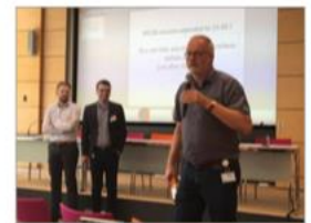
Expert's meeting - 4 and 5 June

WP3 Joint Research Projects - As of January the first, a set of 11 Joint Research Projects has been launched. To assess the start of these projects, an online survey was sent to the Project Leaders around March. The results of the survey showed that all the projects had started without major issues. Moreover, WP3 analysed the needs of the project leaders regarding the private space of the OHEJP website and reported this to WP1, in charge of the construction of a platform allowing internal collaboration and exchange of information. Furthermore, WP3 also submitted guidelines for project coordinators to report (JRP&JIP) and updated guidelines for the submission and selection of project proposals (JRP/JIP). Finally, WP3 started coordinating the organisation of the Annual Scientific Meeting (ASM) of the OHEJP, hosted by Teagasc and NUI Galway in Dublin.