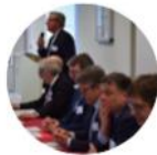
OHEJP Kick off meeting in January 30 & 31 2018