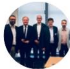
Presentation of SPR & AWP in Brussels at the REA headquarters