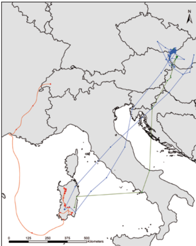
Fig. 5 - Red Kites hatched in the Czech Republic and Switzerland wintering in Sardinia in 2017-18 and 2020-2021. / Nibbi reali nati in Repubblica Ceca e Svizzera svernanti in Sardegna nel 2017-18 e 2020-2021.