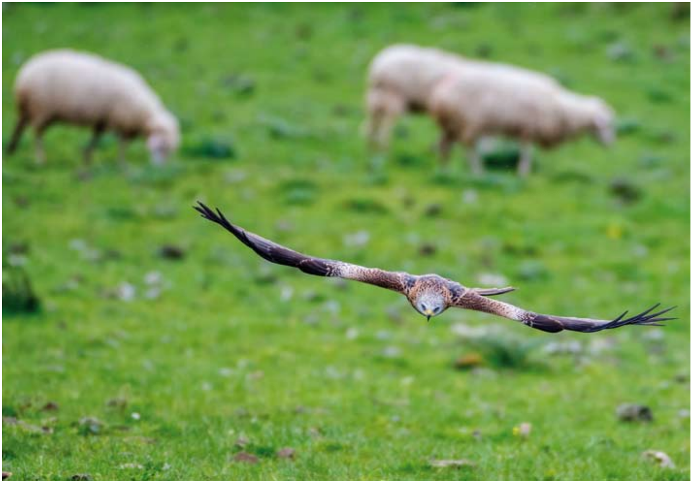
Fig. 1 - Red kite in Sardinia. / Nibbio reale in Sardegna.

In the 19 th century, the species was very common and widespread in Sardinia (Salvatori, 1864; Brooke, 1873; Lepori, 1882), but in the mid-900 an important decline occurred as highlighted by Bezzel (1957).