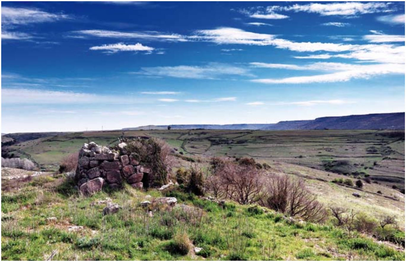
Fig. 2 - Red kite habitat in north west Sardinia. / Habitat del nibbio reale nel nordovest Sardegna.