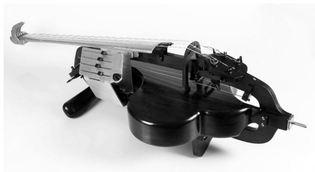
Figure 1. The halldorophone

There is a pronounced research strand in the lab focusing on feedback instruments. A long-lasting interest by members of the lab, related to dynamical systems [7][11], the research of feedback as a design principle in instruments became grounded with the membership of Halldor Ulfarsson, whose research project is on the innovation of his electroacoustic, cello-like string instrument called halldorophone [19]. The halldorophone ( Figure 1 ) has spawned further research projects, such as Eldridge and Kiefer's feedback cello project [9]; their current research investigates the application of language and mathematical tools of complexity and dynamical systems to understand and finesse the musical behaviour of feedback instruments. Eldridge and Kiefer are members of the Brain Dead Ensemble ( Figure 2 ) together with Thanos Polymeneas Lontiris (feedback bass) and Thor Magnusson (Threnoscope). This is an acoustically network ensemble [18] that has performed widely and recently released an album, EFZ on Confront Recordings and featured on a Silent Records compilation (see www.emutelab.org/label ).