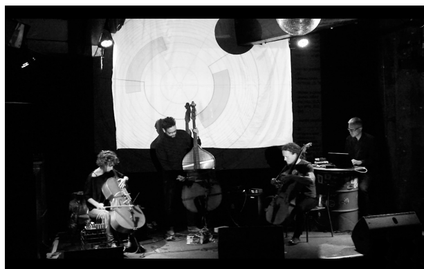
Figure 2. The Brain Dead Ensemble in action

experimental music, Alife and ecoacoustics, an area in which Eldridge has carried out pioneering research (see below).