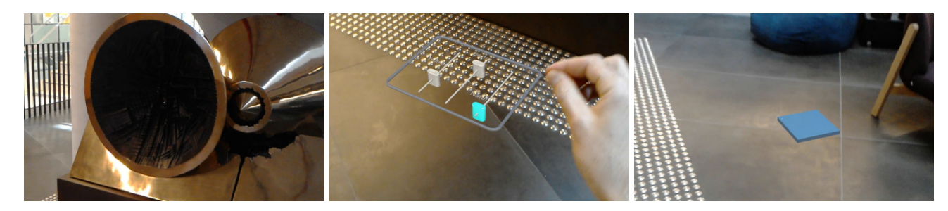
Figure 4: A user's view of the installation: The sculpture (left); mixer interface from interaction A (centre); and floor panels representing the location of audio sources from interaction B.