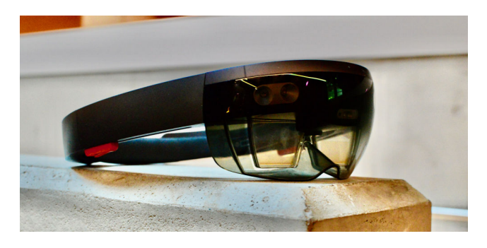
Figure 2: The HoloLens augmented reality wearable computer.

to build an interactive sonic landscape to engage with a public sculpture. Our paper contributes the technique of using an invisible hologram as a means of interaction in augmented reality and two interaction designs which have been assessed through our experiences creating and demonstrating this proof-of-concept system.