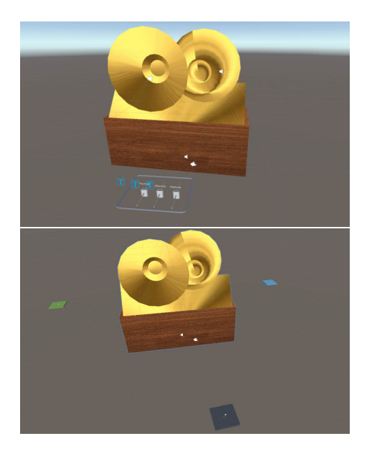
Figure 5: The unity scenes for our two interactions: mixer interface (top), and audio sources represented by panels (bottom).

allow users to listen to three different understandings of the place and significance of the sculpture, and the sound artwork encourages users to move and interact with these recordings and engage more deeply with the idea of the sculpture and its environment.