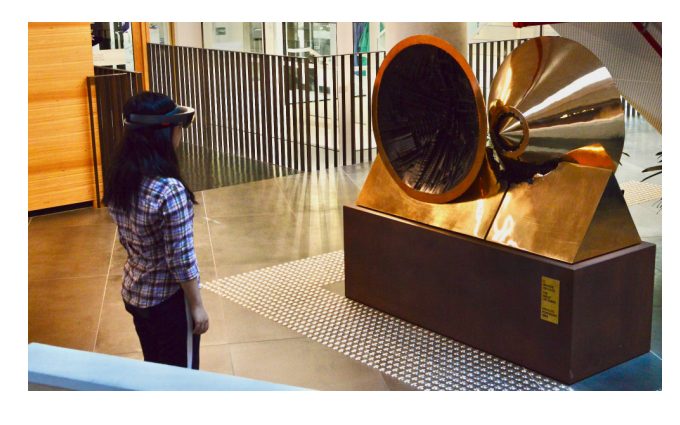
Figure 1: A user engaging with a physical sculpture through our AR sound artwork. A video can be found at: https://doi.org/10.5281/zenodo.3773653

NIME'20, July 21-25, 2020, Royal Birmingham Conservatoire, Birmingham City University, Birmingham, United Kingdom.