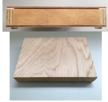
Figure 1: Wooden Box Construction

Participants were asked to control a single parameter within nine different musical examples in an Ableton Live session. The first three examples controlled the volume of a given track (Piano, Kick Drum or Synth), the second three examples controlled the resonant frequency of an audio filter (Low-pass filter on Bass and Kick/Snare and a Highpass filter on Strings), the final three examples controlled the wet/dry mix of reverb (Kick Drum, Guitar, or in one example the entire mix)