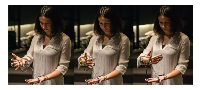
Figure 5: ASL music gesture creates beating effects with waving the hand captured through accelerometer worn on the right hand.

categorical components from speech-plus-gesture and imagistic components from gestures [9]. On the other hand, we observe that musicians, too, adopt gestures' functionality and communicative and expressive components [7]. Like in music, the gestures in sign languages appear intuitively to understand and express. From language to music performance, gestures from numerous domains overlap in expression, functionality, and communication. In Felt Sound, we explore the expressive and communicative nature of gestures—not limited to their meanings—by adopting movement into DMI performance. Our main purpose is to draw the performer's focus to bodily movement with an unconventional gestural vocabulary.