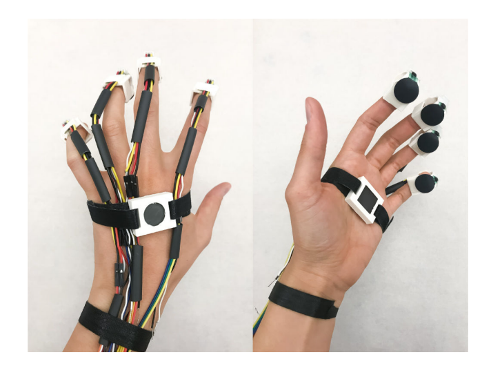
Figure 2: The prototype of Felt Sound's interface

sounds designed to produce physical sensations (as output). This work borrows from American Sign Language (ASL) gestures, potentially with or without their overt meaning.