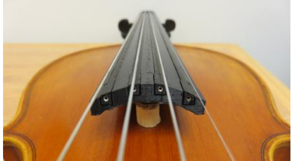
Figure 3. Front view of the end of the fingerboard without the Arduino and FSRs.

printed violins have addressed this problem with support rods.<sup>2</sup> However, the slots for the conductive strips leave very little room to include a support rod. Therefore, we worked with a luthier who placed a thin, flat piece of ebony onto the neck of the violin to support the PLA surface. After a few weeks, while the fingerboard continued to support the weight of the finger pressure, we found the natural placement of the fingerboard started to sag. In response, the luthier also placed a small piece of wood underneath the fingerboard to prop it up into the correct position (see Figures 2 and 3). A copy of the fingerboard was made from PETG filament. It was not noticeably stronger than the PLA version. Aesthetically, the PLA version is preferred because it is not as shiny as the PETG.