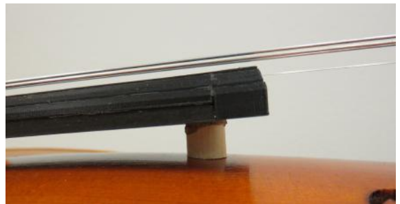
Figure 2. Side view of the end of the fingerboard and support.