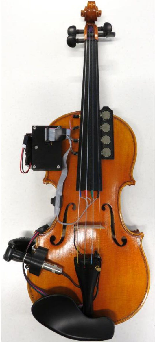
Figure 1. TRAVIS II with electronics setup.

cover the areas on the fingerboard below high second position; to sense in all positions, the nut and therefore the string height would need to be raised to prevent SoftPots from contacting the vibrating strings. Also, the player can only use the SoftPots on the G and E strings; there is no sensing on the D and A strings. Furthermore, the aesthetic of TRAVIS I makes it difficult to use in traditional contexts. Its SoftPots and wiring are permanently attached and cannot be removed from the violin when stored in its case. Finally, TRAVIS I has only two FSRs to trigger presets, which limits its compositional potential.