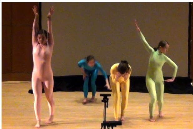
Figure 2. Performance of Cheap Loops

In tests and in the performance work, choreography was created to specifically test the system's ability to deal with constant occlusion of different dancers, to deal with reacquisition of dancers, and to handle the tracking of different dancers at various depths and widths. In the choreography no tracking of target points on limbs was carried out: colour tracking was the only concern.