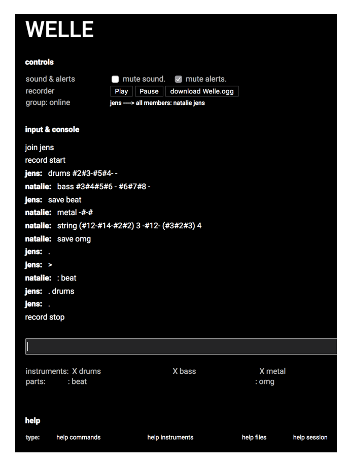
Figure 2: screenshot of the live version of WELLE at https://tangible.uber.space/

Regarding compositions, it is possible to save individual parts while playing. They are snapshots of the current active collection of instruments, patterns and other parameters such as volume and randomizing. These parts are then displayed below the input field and can be reactivated at any time. They can be used to e.g. structure a performance. Other features are network collaboration, preset storage, interaction alerts, recordings of the session. The help section at the bottom of the website contains interactive examples and more detailed explanations of implemented features.