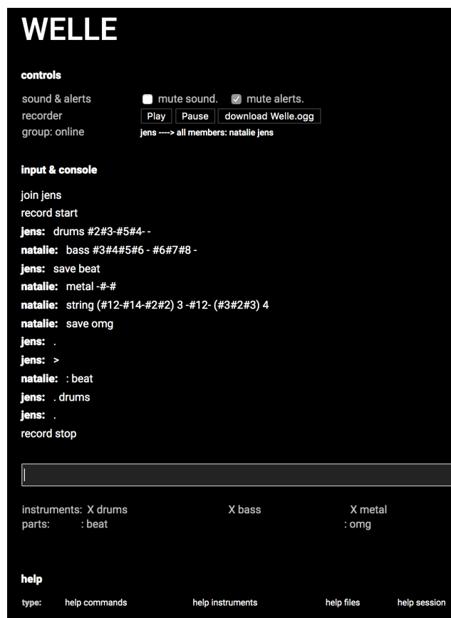
Figure 2: screenshot of the live version of WELLE at https://tangible.uber.space/

Regarding compositions, it is possible to save individual parts while playing. They are snapshots of the current active collection of instruments, patterns and other parameters such as volume and randomizing. These parts are then displayed below the input field and can be reactivated at any time. They can be used to e.g. structure a performance. Other features are network collaboration, preset storage, interaction alerts, recordings of the session. The help section at the bottom of the website contains interactive examples and more detailed explanations of implemented features.