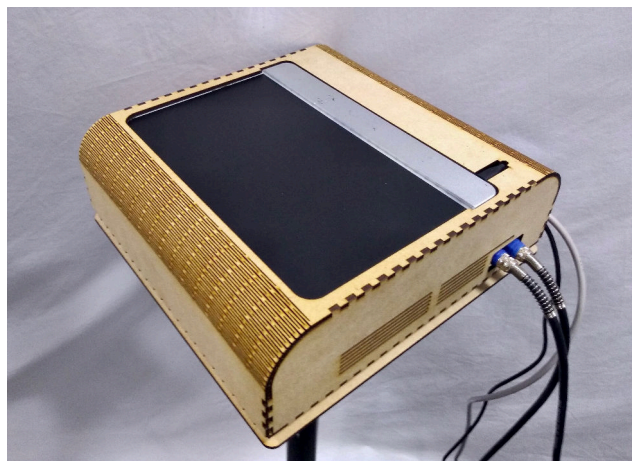
Figure 1: Vodhrán with Sensel Morph interactive surface.

As a step in exploring our ideas in [6] and building our understanding of instrument exploration and skills acquisition, following the likes of [3], we have designed a proto-instrument, the Vodhrán displayed in Fig. 1. The Vodhrán is utilised to provide musicians with an intuitive and naturalistic interaction with a physical model. We define it as a proto-instrument as its evolution will be informed by participatory, user-centred, and cooperative design [7] using professional performers to explore and help create a musical dictionary of Vodhrán techniques that can then be taught to novices. Feedback from both groups will help shape what will become a fully developed musical instrument in education and professional performance contexts.