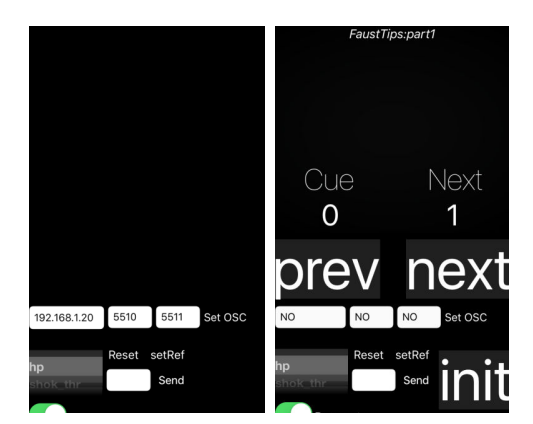
Figure 3. Interface of faust2smartphone

This suite works with a sub-mode of motion mode, we call it cueManager. We provide a simple interface for this mode to deal with the code composed with different cues. To active cueManager, you just need to add –cuemanager in the command line.