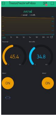
Figure 3 ‘blynk’ Mobil-Phone-Application used to control and monitor SCG-IoT