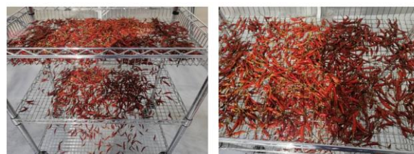
Figure 4 Quality of Dried Chili by SCG-IoT

2.2) The quality of Chili in SCG-IoT (see Figure 4)