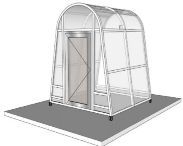
Figure 2 SCG-IoT Structure and Architecture

1.3 Structural design and architecture of SCG-IoT From the results of the study mentioned in 1.1 and 1.2, the research team used them as a design framework of the structure and architecture of SCG-IoT shown in Figure 2 below.