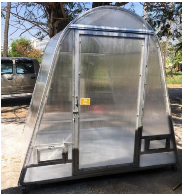
Figure 4 SCG-IoT