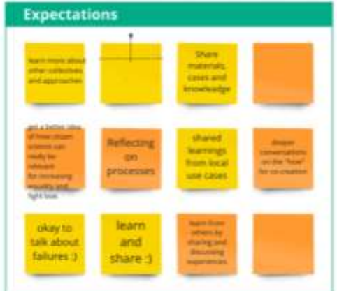
Figure 3: Experiences and expectations

The community did agree upon the need for some central coordination despite the co-owning nature of our community building agenda. Moreover, identifying dedicated tasks alongside the sharing of recurring tasks has been highlighted in order to make the process ahead of us a realistic and continuous endeavor.