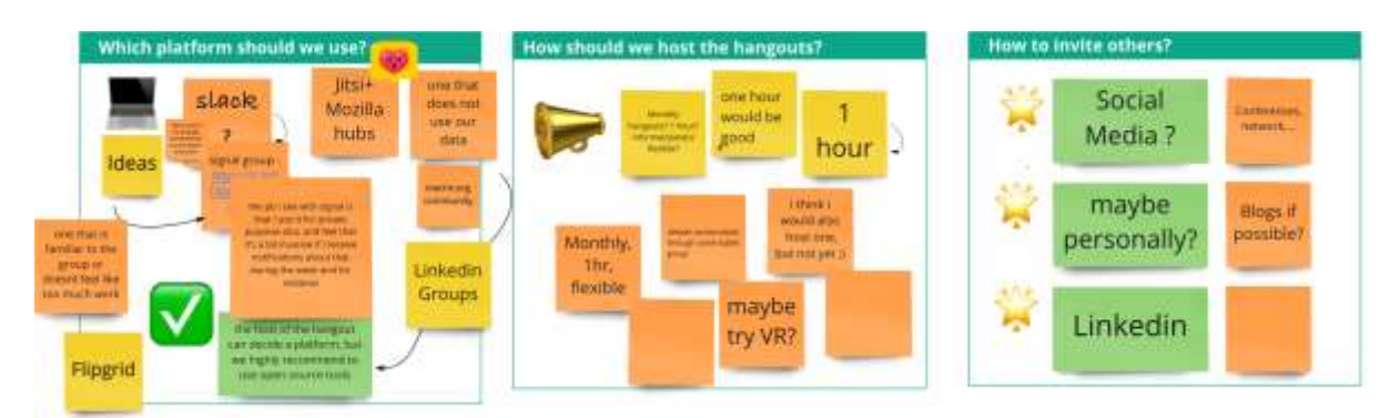
Figure 2: Platforms, formats, outreach and engagement

For the monthly hangouts we will not pre-assign a specific platform but leave it open to the respective members organizing a hangout which platforms and tools they wish to use. This allows us to address the needs of different members. Additionally, it allows the community to learn and try out tools some of us have potentially not yet been familiarized with. The community hangouts will provide a safe space for members, therefore not being publicly announced nor recorded.